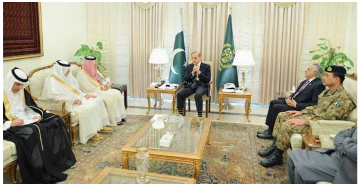
ISLAMABAD: Minister of State for Foreign Affairs of Kingdom of Saudi Arabia H.E. Adel Al-Jubeir called on Prime Minister Shehbaz Sharif in Islamabad on May 9, 2025.