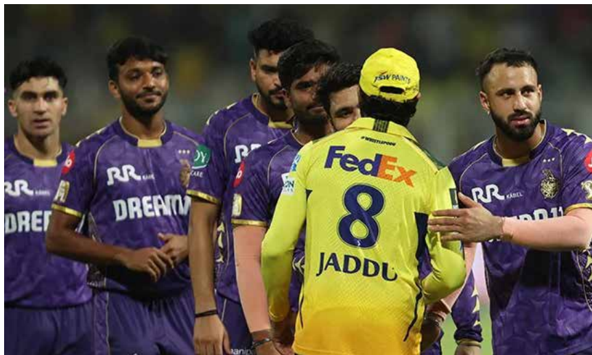
cording to the statement. All participants agreed that continuing the tournament under current conditions was not viable. Thursday's IPL match was abandoned mid-