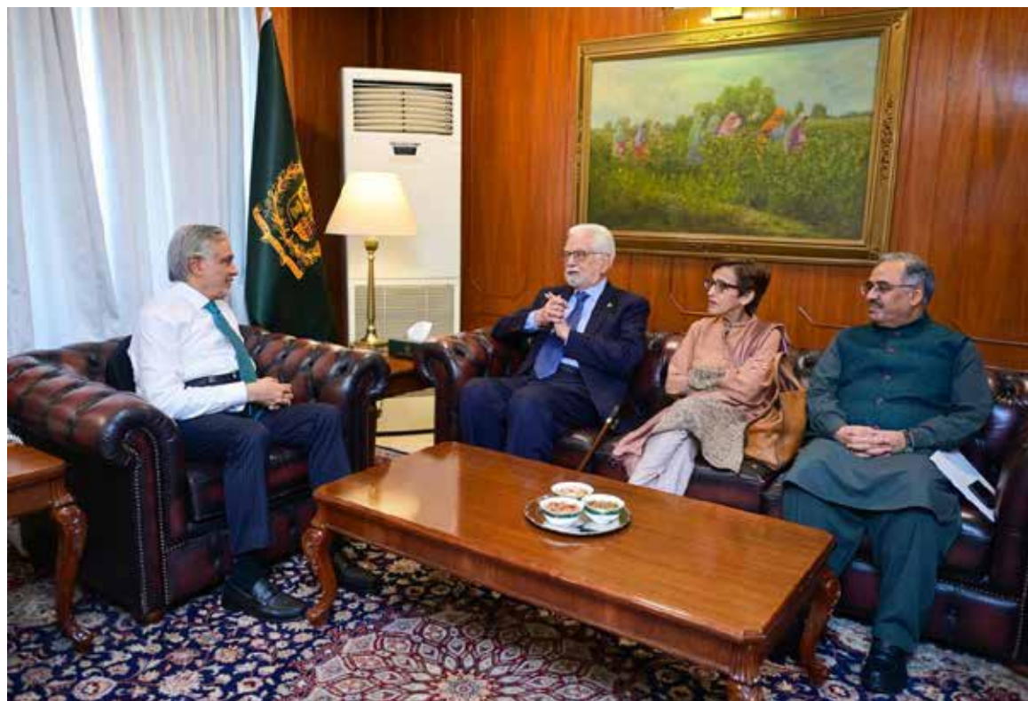
ISLAMABAD: Deputy Prime Minister/Foreign Minister, Senator Mohammad Ishaq Dar discusses recent regional developments with a delegation of former foreign secretaries during the meeting.

percent of the applications received for the wheat support program have been verified so far. The meeting included a detailed review of implementation proposals for the wheat support program, including a recommendation to extend eligibility to land contractors in addition to landowners. Chief Minister Maryam Nawaz Sharif also reviewed the progress of the agricultural tube wells solarization scheme, reiterating her government's vision of modernizing Punjab's agriculture through sustainable and farmer-friendly initiatives.