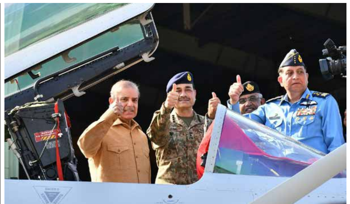
ISLAMABAD: The Prime Minister of Pakistan, Shehbaz Sharif, accompanied by Chief of Army Staff, General Syed Asim Munir and the Chief of the Naval Staff, visited the Pakistan Air Force's operational base at Kamra, on Thursday.

PAKISTAN welcomes the United States' decision to lift sanctions from Syria, marking a pivotal step towards regional stability and economic recovery. Pakistan has consistently advocated for constructive engagement and dialogue. The easing of sanctions is expected to facilitate economic growth, improve access to essential services, and support the rebuilding efforts of the Syrian authorities. We commend the commitment of all countries, in particular the US, Turkiye, Saudi Arabia, and Qatar, working constructively towards a peaceful Syria, the foreign ministry said. Pakistan supports a Syrian-led and Syrian-owned resolution and remains steadfast in its support for Syria's unity, sovereignty, and territorial integrity, it added.