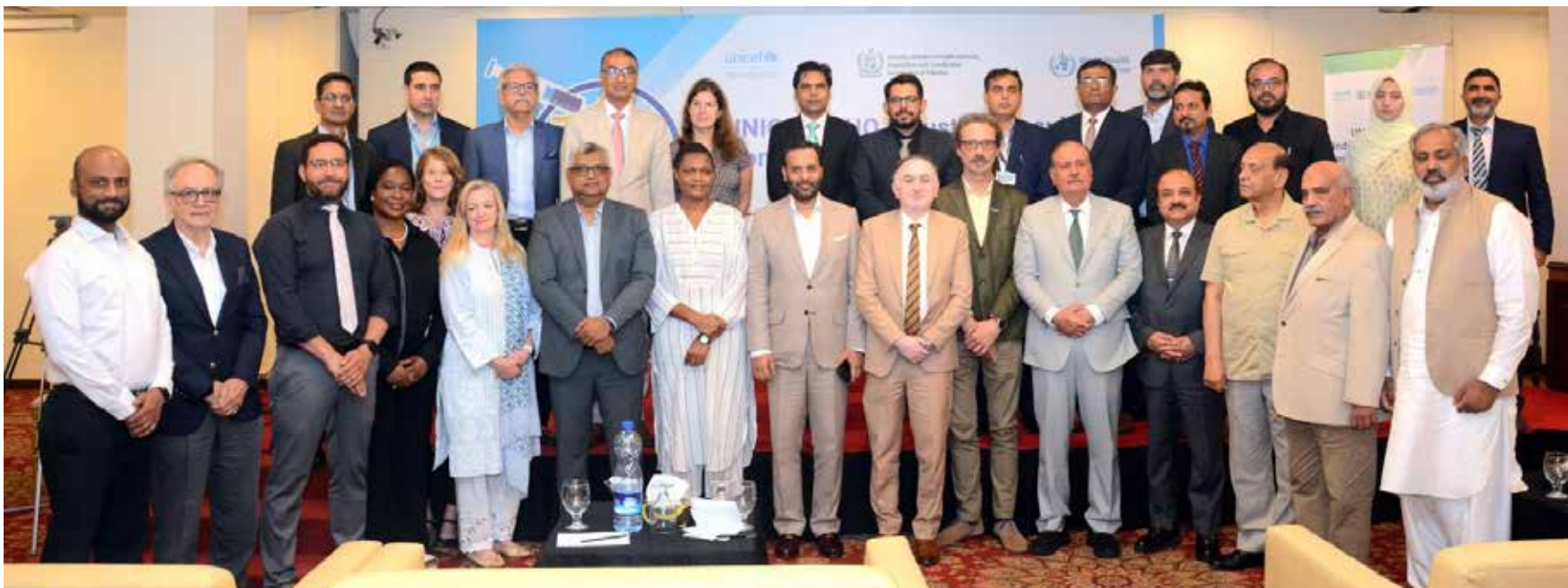
ISLAMABAD: Federal Minister for Health Syed Mustafa Kamal with participants at "UNICEF-WHO Industry consultation on local production of vaccines and pharmaceuticals session."

ISLAMABAD: Indus River System Authority (IRSA) on Thursday released 172,689 cusecs water from various rim stations with inflow of 200,634 cusecs. According to the data released by IRSA, the water level in the River Indus at Tarbela Dam was 1464.45 feet, which was 62.45 feet higher than the dead level of 1402.00 feet. Water inflow and outflow in the dam was recorded as 97,900 cusecs and 82,000 cusecs, respectively. The water level in the River Jhelum at Mangla Dam was 1145.45 feet, which was 95.45 feet higher than its dead level of 1,050 feet. The inflow and outflow of water was recorded 40,045 cusecs and 28,000 cusecs respectively.—APP