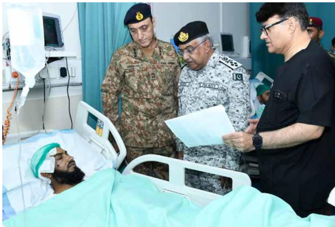
RAWALPINDI: Chief of the Naval Staff Admiral Naveed Ashraf visits Combined Military Hospital (CMH) and pays tribute to injured troops of operation Bunyanum Marsoos.