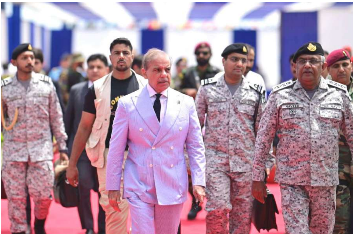
ISLAMABAD: Prime Minister Muhammad Shehbaz Sharif, visited Pakistan Navy Dockyard to pay tribute to the Pakistan Navy for its pivotal role in Operation Bunyanum Marsoos.