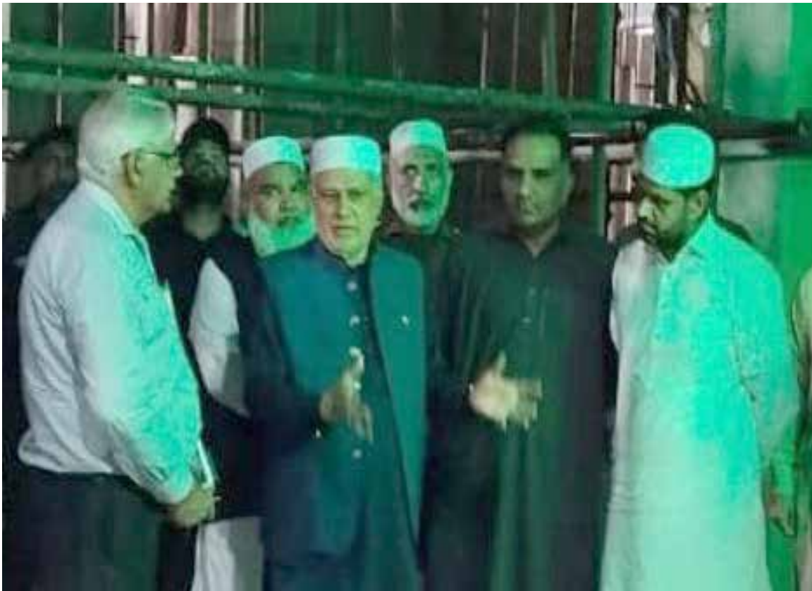
LAHORE: Deputy Prime Minister/Foreign Minister, Senator Mohammad Ishaq Dar visited the holy shrine of Hazrat Data Ganj Baksh (RA), offered prayers, and also reviewed the ongoing reconstruction work.