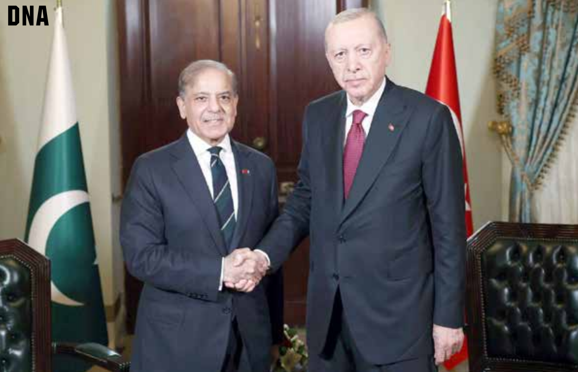
ISTANBUL: Prime Minister Shehbaz Sharif welcomed by Türkiye President Recep Tayyip Erdogan.