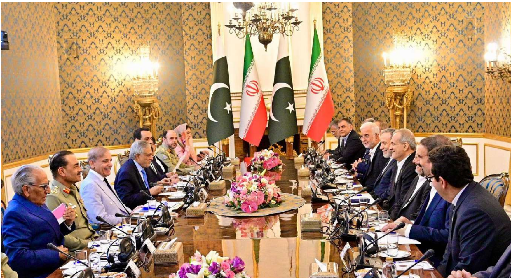
TEHRAN: President of Iran Dr. Masoud Pezeshkian and Prime Minister Shahbaz Sharif held delegation level meeting at Sa'dabad Palace.

FROM PAGE 01 nearly 54,000 Palestinians, the majority of whom were women and children. Abela said the move is a moral responsibility and that Palestine will be recognised following a conference on June 20.