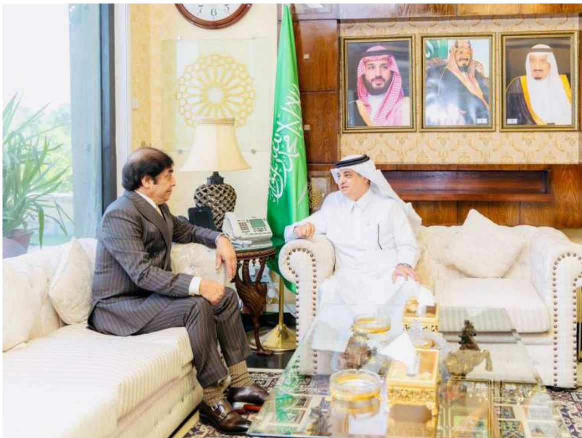
Islamabad: Minister of Railways Muhammad Hanif Abbasi met with Saudi Ambassador Nawaf bin Saeed Ahmad Al-Malkiy to discuss matters of mutual interest on Monday.