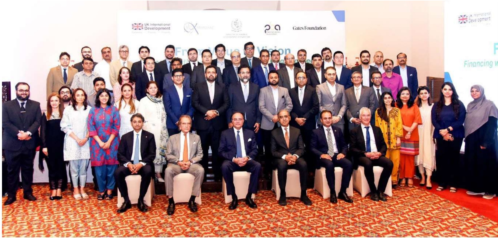
ISLAMABAD: Federal Minister for Finance & Revenue Senator Muhammad Aurangzeb with the organizers and participants of the Impact Financing event organized by Karandaaz Pakistan and Pakistan Banks Association (PBA) on Monday. – DNA

ISLAMABAD, May 26 (APP): The Rupee on Monday depreciated by 08 paise against the US Dollar in the interbank trading and closed at Rs 282.05 against the previous day's closing of Rs 281.97. However, according to the Forex Association of Pakistan (FAP), the buying and selling rates of the dollar in the open market stood at Rs 282.65 and Rs 284.15, respectively. The price of the Euro increased by Rs 1.60 to close at Rs 321.34 against the last day's closing of Rs 319.74, according to the State Bank of Pakistan (SBP). The Japanese yen went up by 01 paise and closed at Rs1.97, whereas an increase of Rs 2.52 was witnessed in the exchange rate of the British Pound, which was traded at Rs 382.70 as compared to the last day's closing of Rs 380.18. The exchange rates of the Emirates Dirham and the Saudi Riyal increased by 02 and 03 paise to close at Rs 76.79 and Rs 75.20, respectively.—APP