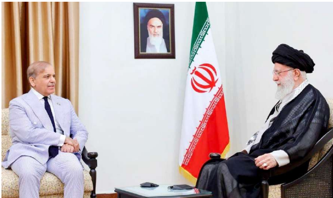
TEHRAN: Prime Minister Muhammad Shehbaz Sharif paid a courtesy call on His Eminence Sayyed Ali Khamenei, the Supreme Leader of Iran. Tehran, 26 May 2025.

Malta to recognise State of Palestine next month