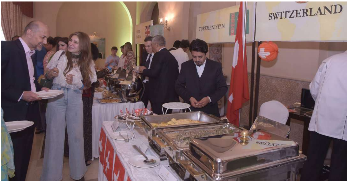
it a fun and festive family outing. The proceeds from the bazaar will be used to support local NGOs working in the fields of education, healthcare, and women’s empowerment. The IFWA bazaar not only provided an opportunity for cultural exchange but also reaffirmed the spirit of generosity and community support that defines Islamabad’s vibrant diplomatic community.

ISLAMABAD: The Islamabad Serena Hotel was abuzz with color, culture, and culinary delights as the International Foreign Women’s Association (IFWA) hosted its much-anticipated annual charity bazaar, drawing a large crowd of diplomats, expatriates, and local guests. Held in the elegant halls of the Serena, the bazaar featured a vibrant collection of stalls set up by embassies and international communities, showcasing traditional handicrafts, cultural items, and, most notably, an array of authentic delicacies from around the world. Guests eagerly sampled cuisine from Africa, Europe, Asia, and the Americas, turning the event into a global food festival. From freshly baked pastries and delights to spicy curries and savory Middle Eastern dishes, the bazaar offered something for every palate. Children and adults alike were seen enjoying the food and cultural performances, making