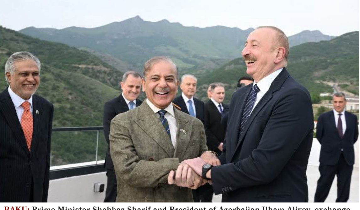
BAKU: Prime Minister Shehbaz Sharif and President of Azerbaijan Ilham Aliyev, exchange pleasantries during a meeting in Baku, on Tuesday.

Prime Minister Shehbaz Sharif is also on its visit to Baku to thank the Azerbaijani people and leadership for their unwavering support for Pakistan during the recent tensions with India. Addressing questions about recent claims by Pakistani military officials regarding the destruction of Russian-made S-400 air defense systems, Ambassador Khorev stated that he had heard of these reports but lacked confirmation. Regarding the ongoing conflict in Ukraine, Khorev reiterated Moscow's commitment to peace negotiations, emphasizing that Russia's primary objective is to protect Russian-speaking populations in Ukraine. He warned that if diplomatic efforts fail, Russian forces may advance towards Kyiv, asserting, "We don't need more territories; we need to protect Russian-speaking people in Ukraine.