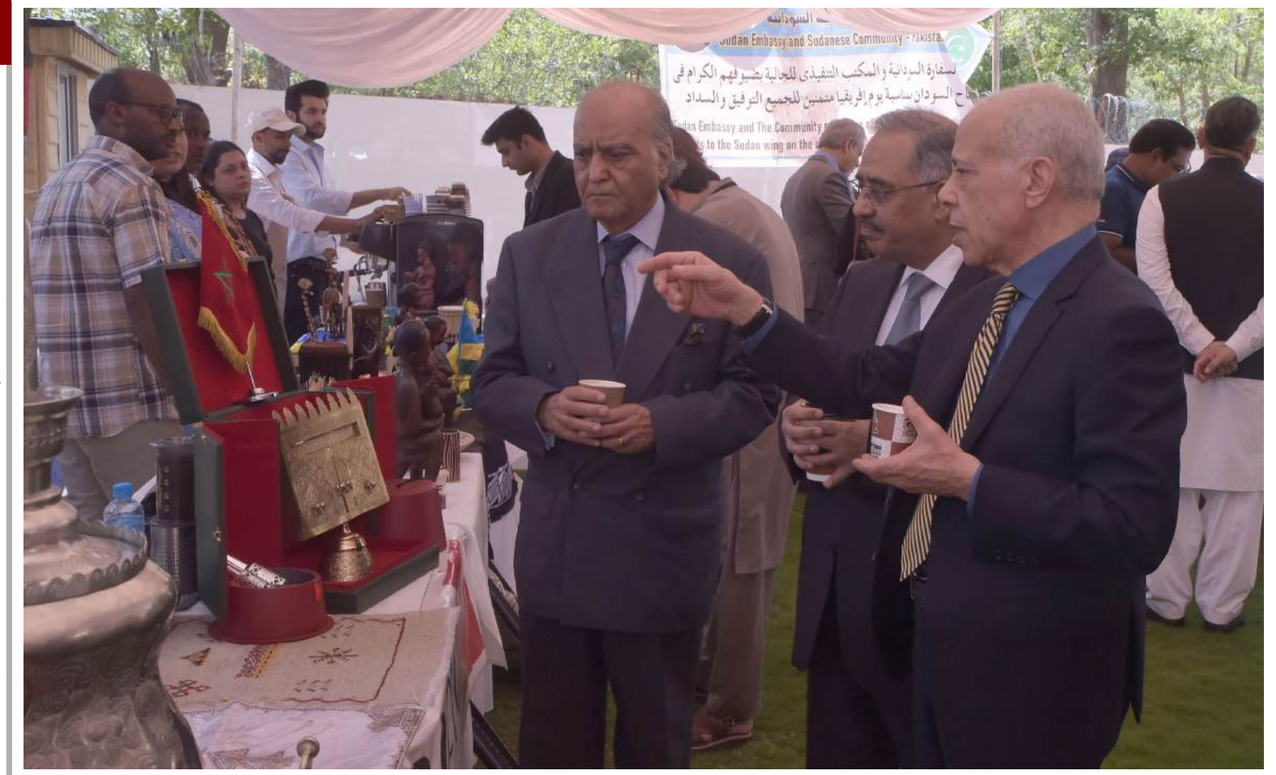
ISLAMABAD: Guests enjoying various Arican delicacies on the occasion of Africa Day celebrations held at the ISSI.