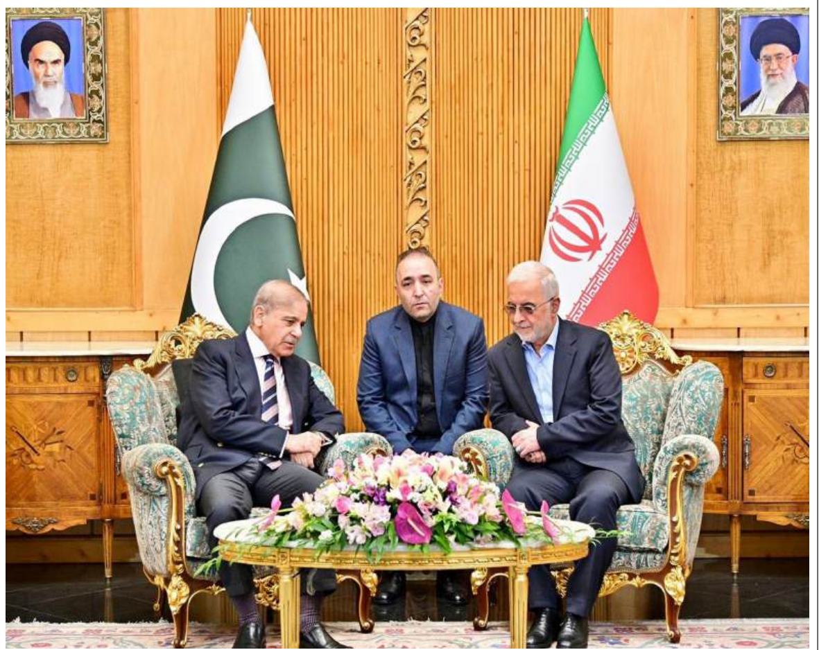
Tehran: Iranian Interior Minister Eskandar Momeni seeing off Prime Minister Muhammad Shehbaz Sharif at Mehrabad Airport, Tehran.