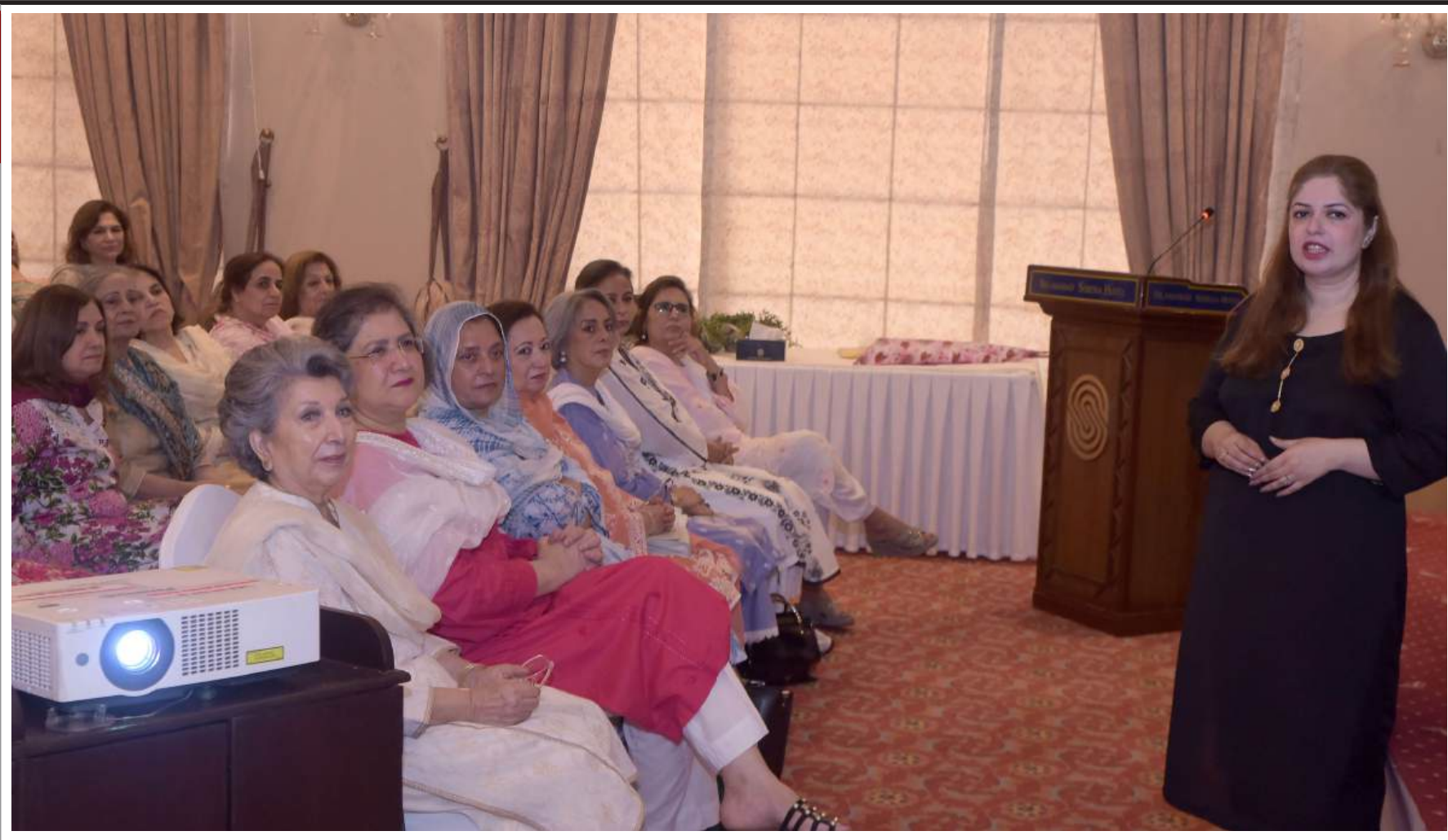
ISLAMABAD: Members of the Floral Art Society attending a briefing session held at Islamabad Serena Hotel, on Tuesday.