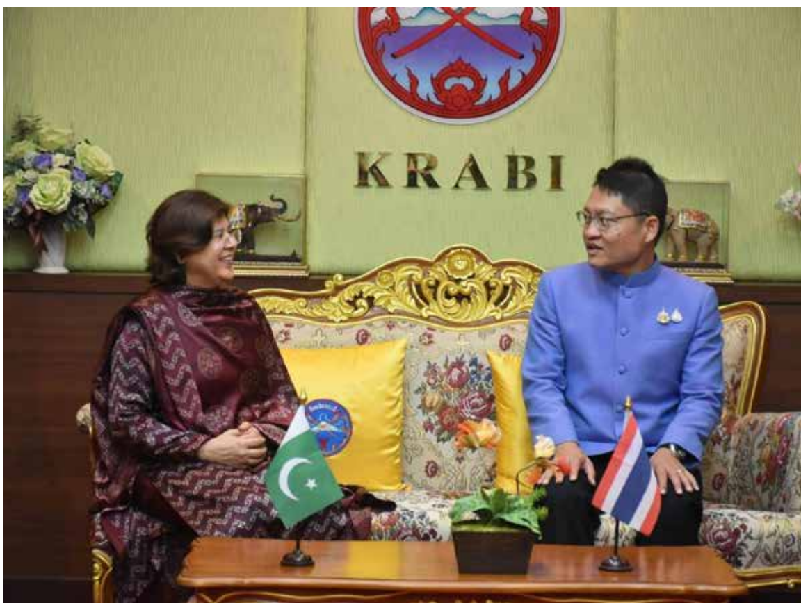
KARABI: Ambassador Rukhsana Afzaal called on the Governor of Krabi. They discussed ways to enhance bilateral trade, tourism, cultural cooperation, and people-to-people contacts. Ambassador thanked the Governor for fostering a conducive environment for business and investment in the province; one where people from all nationalities can thrive and live in harmony.—DNA

business leaders and think tank representatives. In a separate meeting with Senator Mushahid Hussain Sayed, Minister Liu Jianchao referred to high-level exchanges of successful visits between Pakistan and China, citing his own visit to Pakistan in June 2024 and the recent visit of Deputy Prime Minister and Foreign Minister Ishaq Dar to Beijing. He emphasised that the Communist Party of China will continue to deepen its friendly relations with all political parties of Pakistan. Messages of congratulations to the IDCPC conference were specially sent by the Prime Ministers of Pakistan and Malaysia.