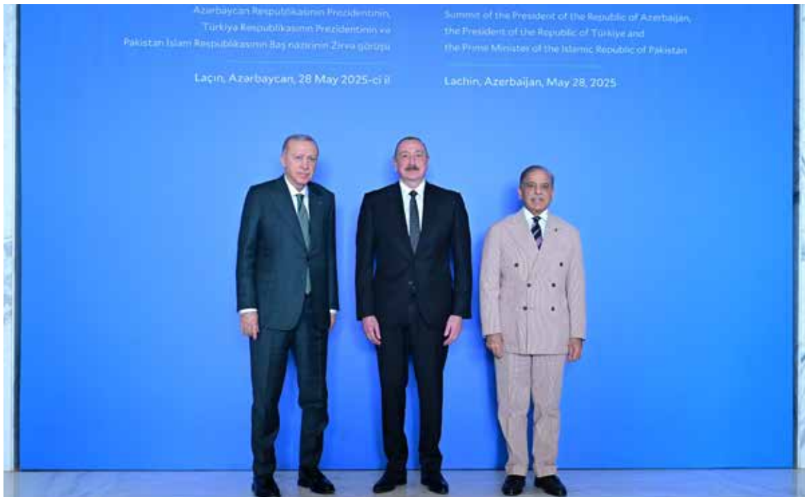
LACHIN: Prime Minister Muhammad Shehbaz in family photo of Pakistan-Türkiye-Azerbaijan Trilateral meeting, on 28 May 2025.