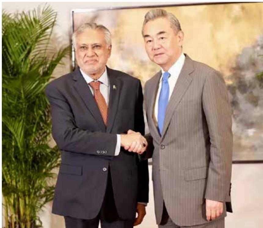
HONG KONG: DPM Ishaq Dar meets Foreign Minister Wang Yi in Hong Kong within a span of 10 days. Congratulated him on successful signing ceremony of the Convention establishing International Organization for Mediation (IOMed), a groundbreaking initiative by China with transformational impact. — DNA