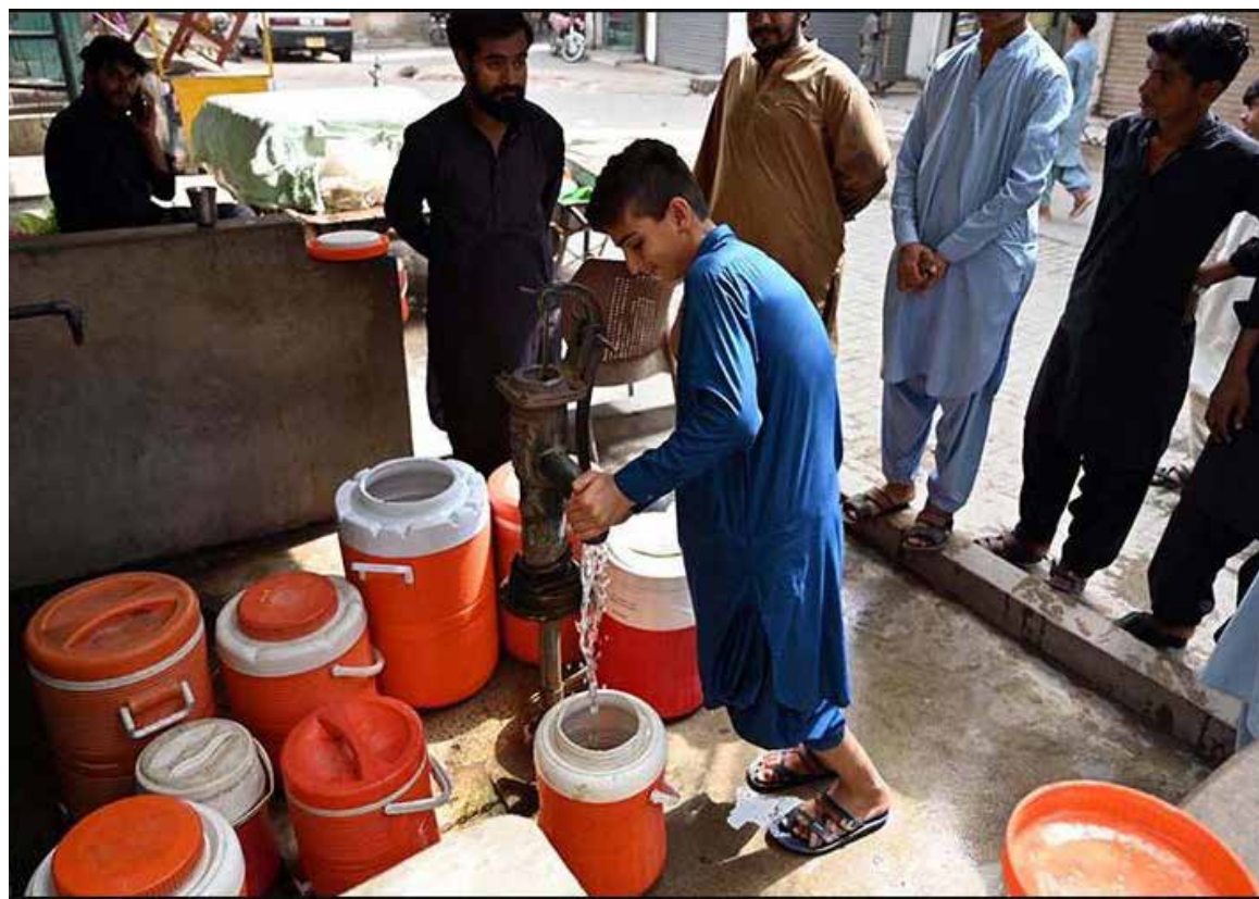
LARKANA: People busy filling water coolers on hand pump during hot day in the city.

Faisal Karim Kundi at the Governor House Islamabad to discuss the promotion of technical education in the province. Governor Kundi highlighted NAVTTC's vital role in empowering youth and supporting economic progress through skill development programs. The two also discussed a proposal to allocate special quotas for children of martyred security personnel from Khyber Pakhtunkhwa and Balochistan in vocational institutes named after Shaheed IG Safwat Ghayur. The initiative was praised as a meaningful tribute to national heroes. They also consulted on potential scholarships for KP students in UK universities. Additionally, the Chairperson handed over the NAVTTC registration certificate for Gomal University, which the Governor welcomed as a positive step for students in the province.—DNA