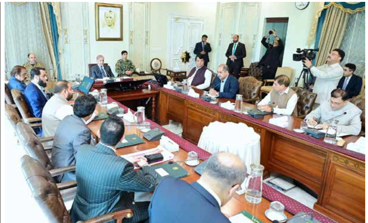
ISLAMABAD: Prime Minister Shehbaz Sharif chairing a high-level meeting regarding promotion of tourism in Pakistan.