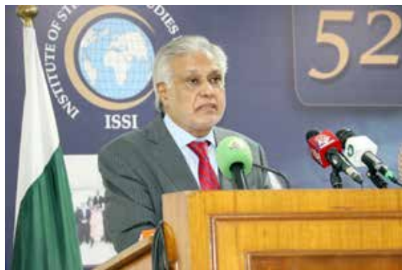
ISLAMABAD: Deputy Prime Minister and Foreign Minister Ishaq Dar speaks at the ISSI.

Defence Minister Khawaja Asif says Indian Prime Minister Modi's political days are numbered