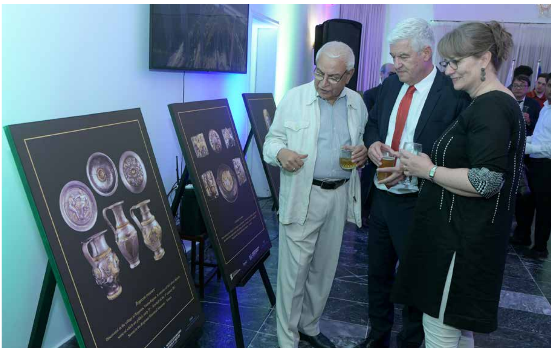
ISLAMABAD: Ambassador of Portugal to Pakistan and others witnessing an exhibition at the Bulgaria embassy.

ISLAMABAD: In a bid to ensure safe and fair travel for commuters, the National Highways and Motorway Police (NHMP) have launched a nationwide campaign targeting overcharging and overloading by public transport operators during the Eid-ul-Azha. According to the spokesperson of the Motorway Police, all bus companies have been strictly directed to refrain from charging passengers more than the officially approved fares. "Strict action will be taken against violators," said Additional Inspector General (IG) of the North Region.—APP