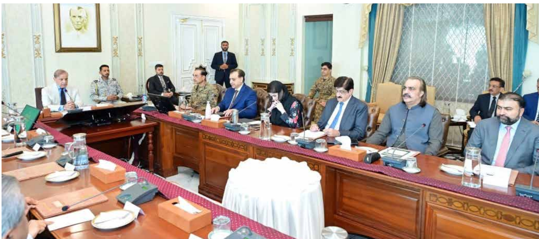
ISLAMABAD: Prime Minister Muhammad Shehbaz Sharif chairs a meeting on water resources and storage , on 5 June, 2025.

ISLAMABAD: Amid on-going talks with the International Monetary Fund (IMF), the government has decided to introduce sweeping energy reforms that include offering 7,000 megawatts of surplus electricity to agriculture and industry at competitive rates. The government is currently sitting on a 7,000MW power surplus, which it intends to sell to the agriculture and industrial sectors at a flat rate of 7 to 7.5 cents per unit – without subsidies. With the current administration retaining net metering for solar energy users, it plans to introduce a more transparent net billing system. “We are not discouraging solar adoption. This is about creating a balanced, transparent and sustainable framework that ensures fair returns for consumers while protecting grid stability and long-term energy planning,” Federal Minister for Energy Sardar Awaiz Ahmad Khan Leghari said.