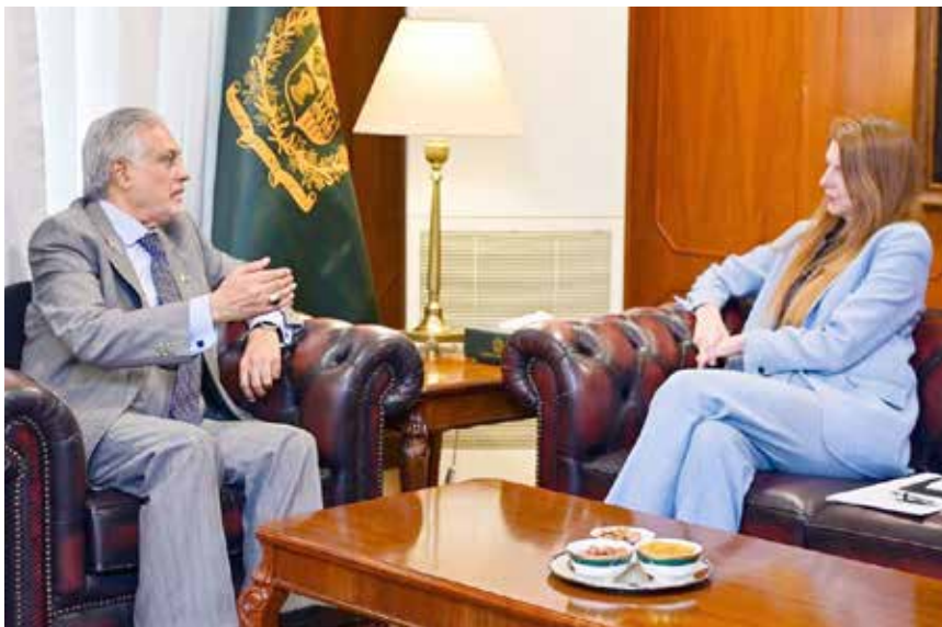
ISLAMABAD: British High Commissioner Jane Marriott called on Deputy Prime Minister and Foreign Minister Ishaq Dar. — DNA

ISLAMABAD: Prime Minister Shehbaz Sharif will undertake an official visit to the United Arab Emirates tomorrow (Thursday) to discuss bilateral, regional and global issues of mutual interest during some high-level meetings. Over the last few months, UAE expressed the country's commitment to strengthening its long-standing partnership with Pakistan and announced a $2 billion debt rollover soon after. In April, the two nations signed and exchanged multiple memoranda of understanding (MoU) to further strengthen the bonds between the people of both nations. A press release issued by the Foreign Office today said that the visit reflected the "deep-rooted fraternal ties" between Pakistan and the UAE, marked by mutual trust, shared values, and close cooperation across multiple sectors.