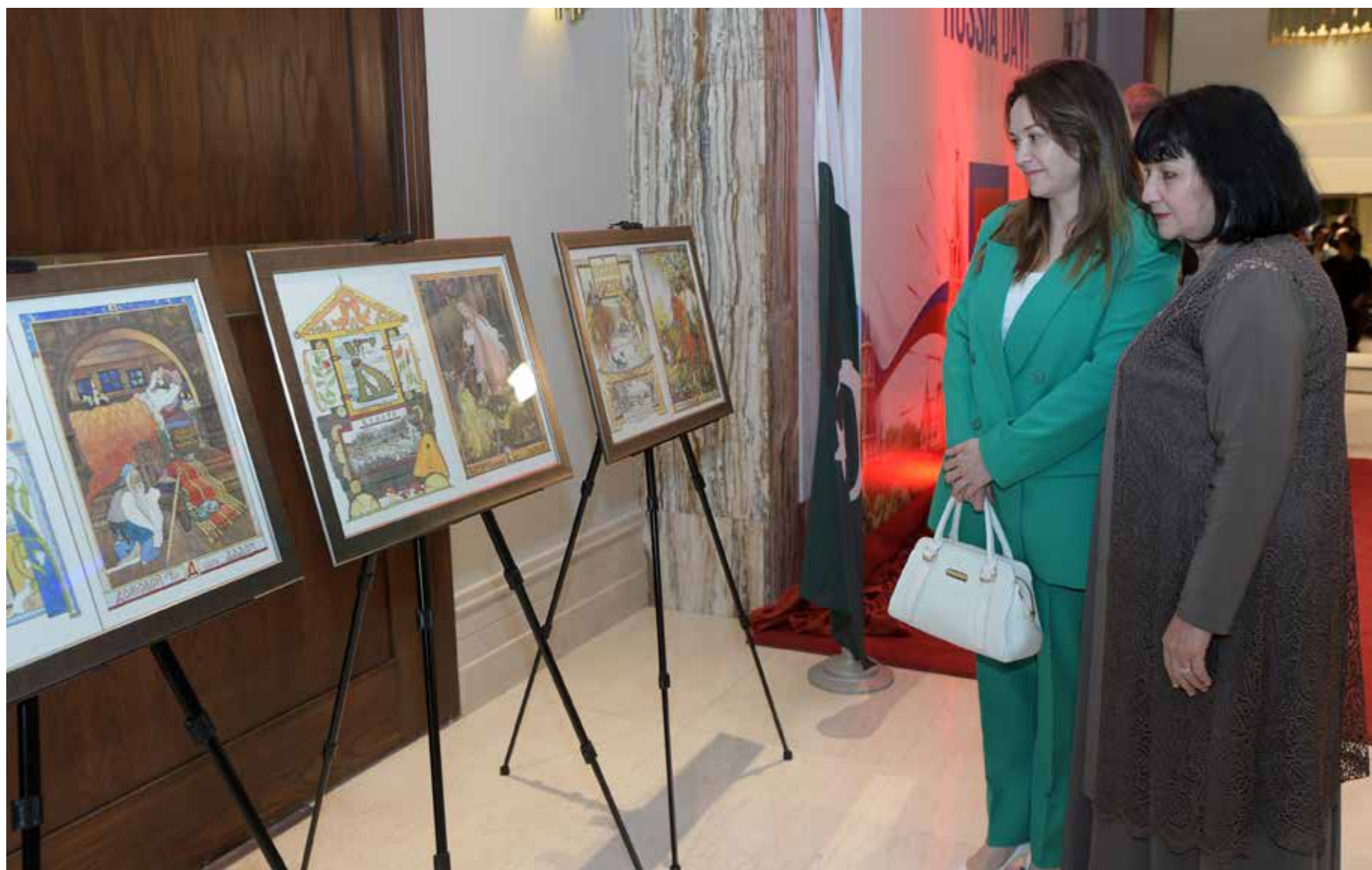
ISLAMABAD: Guests taking interest in various pieces of art during an exhibition on the sidelines of the Russian National Day reception.

ISLAMABAD: Federal Minister for Maritime Affairs, Muhammad Junaid Anwar Chaudhry on Wednesday emphasized the importance of climate-resilient infrastructure in a new maritime strategy, aiming to modernize ports, reduce environmental impact, and boost economic growth. In a series of high-level meetings, the minister reviewed progress across key maritime institutions, including the Port Qasim Authority (PQA), Karachi Port Trust (KPT), Korangi Fisheries Harbour Authority (KoFHA), and the Marine Fisheries Department