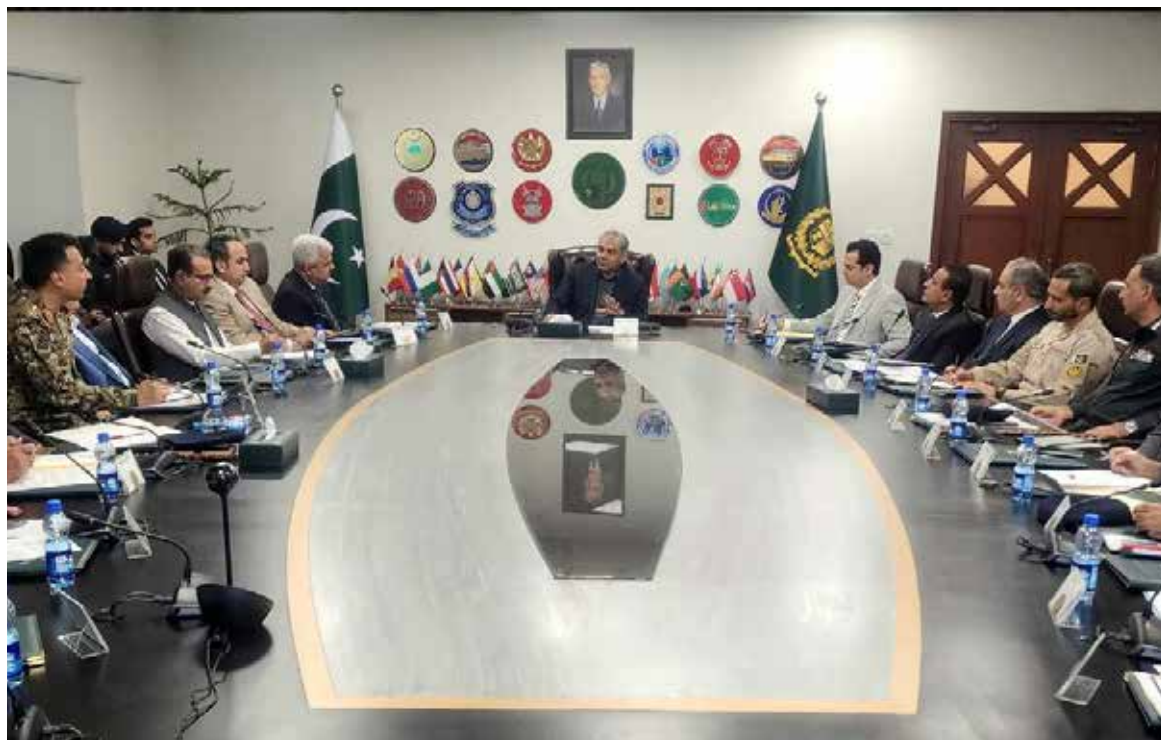
ISLAMABAD: Federal Minister for Interior Mohsin Naqvi chairing a coordination-focused meeting of all departmental heads.

"The opposition faction leaders have decided to bring the bill to dissolve the Knesset to a vote in the Knesset plenum today. The decision was made unanimously and is binding on all factions," the leaders said in a statement, adding that all their parties would freeze their ongoing legislation to focus on "the overthrow of the government.—APP