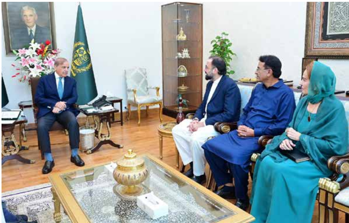
ISLAMABAD: A delegation of MNAs from PML-Q led by Federal Minister for Overseas Pakistanis and Human Resource Development Chaudhry Salik Hussain called on Prime Minister Muhammad Shehbaz Sharif in Islamabad. - DNA

"Sustained reforms and public service delivery initiatives, implementation of the federal budget, successful provincial council elections, and the focus on regional development reflect positive momentum", Ambassador Asim Iftikhar Ahmad