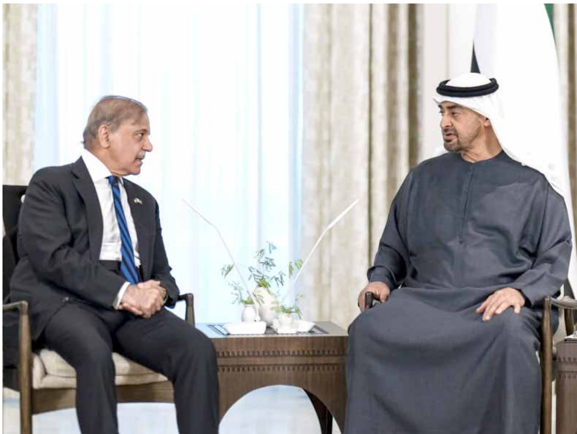
ABU DHABI: President of UAE His Highness Sheikh Mohamed bin Zayed Al Nahyan received Prime Minister Muhammad Shehbaz Sharif at Qasr Al Shati in Abu Dhabi on 12 June 2025.