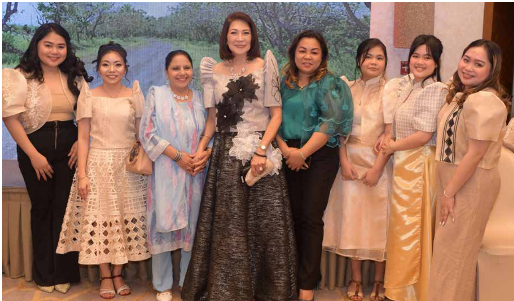
ISLAMABAD: Guests posing for a picture on the occasion of the National day of the Philippines.

ISLAMABAD: The Senate on Friday passed the Societies Registration (Amendment) Bill, 2025, which stipulates that Deeni Madaris already registered under the Societies Registration Act, 1860, or those opting for direct registration with the Directorate General of Religious Education, will be deemed duly registered. Minister for Law and Justice Azam Nazeer Tarar, while presenting the bill, informed the Senate that two parallel streams exist for seminary registration: one includes religious seminaries affiliated with the federal government, functioning under a structured system