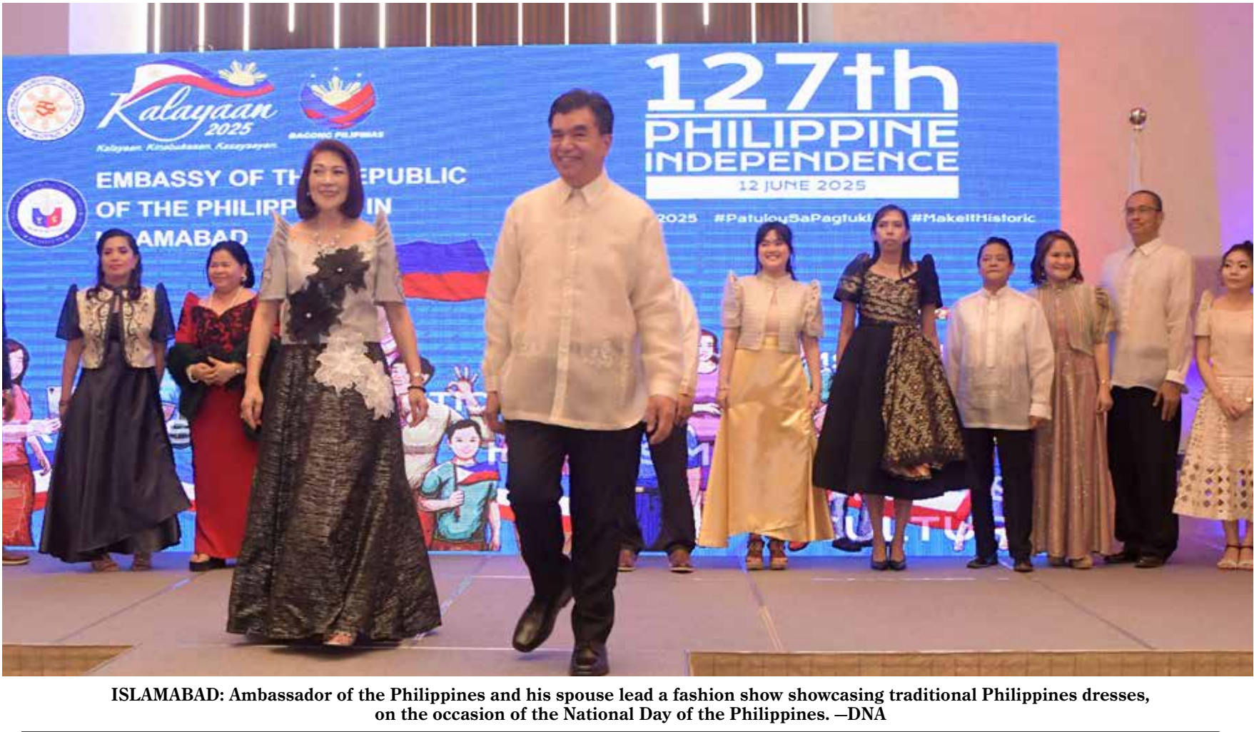
ISLAMABAD: Ambassador of the Philippines and his spouse lead a fashion show showcasing traditional Philippines dresses, on the occasion of the National Day of the Philippines. —DNA