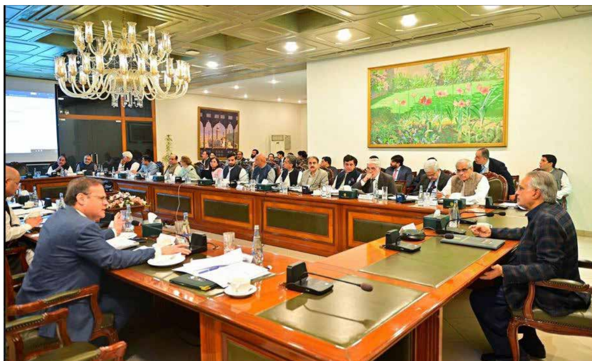
ISLAMABAD: Deputy Prime Minister and Foreign Minister, Senator Mohammad Ishaq Dar, chaired a high-level meeting to review preparations for the upcoming 12th session of the Pakistan-UAE Joint Ministerial Commission (JMC) in Abu Dhabi, at MoFA.

responsibilities towards immediately halting this aggression and avoiding escalation that could ignite a wider conflict, which would have dire consequences for regional and international peace.' In its condemnation of the attacks, Bahrain's Ministry of Foreign Affairs warned of its "grave repercussions on regional security and stability". And it called for "de-escalation, restraint, and a reduction in tensions". The Ministry reiterated Bahrain's call for an immediate halt to military escalation to spare the region and its people from the consequences on regional stability, security, and international peace. And it affirmed Bahrain's stance advocating for the resolution of the crises through dialogue and diplomatic means, as well as the necessity of continuing US-Iranian negotiations regarding the Iranian nuclear file.—Agencies