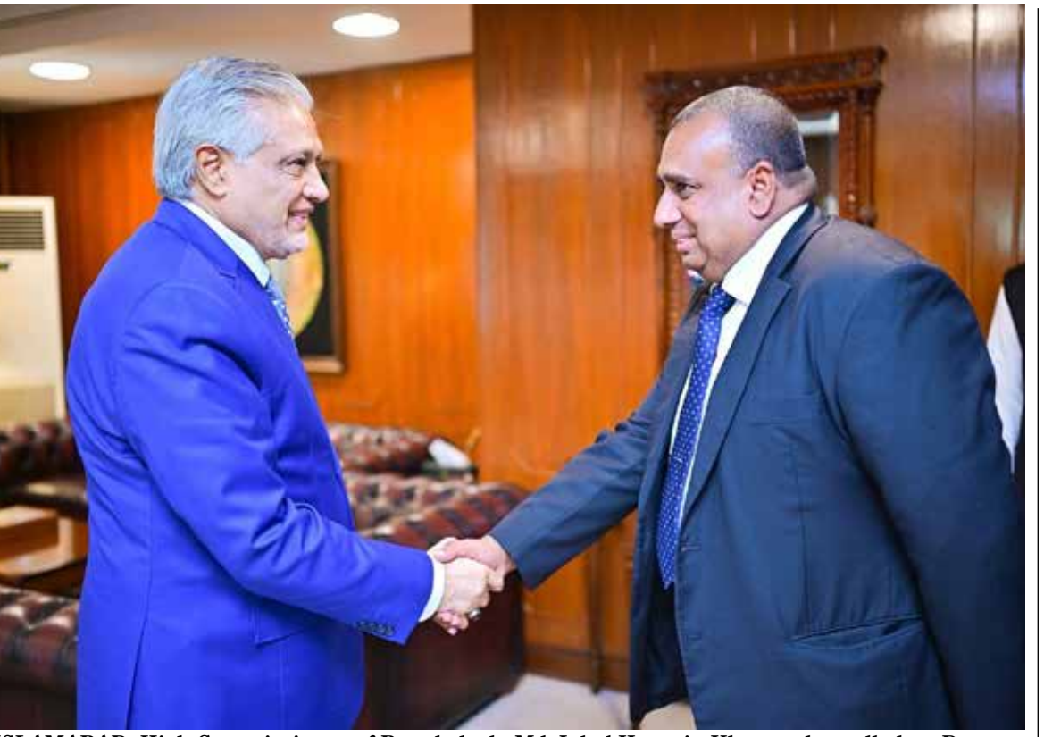
ISLAMABAD: High Commissioner of Bangladesh, Md. Iqbal Hussain Khan, today called on Deputy Prime Minister/Foreign Minister, Senator Mohammad Ishaq Dar. The DPM/FM underscored the importance Pakistan attaches to its brotherly relations with Bangladesh. Appreciating the positive trajectory of bilateral ties, he emphasized the need to further expand cooperation- especially in trade, tourism, & people-to-people exchanges.—DNA