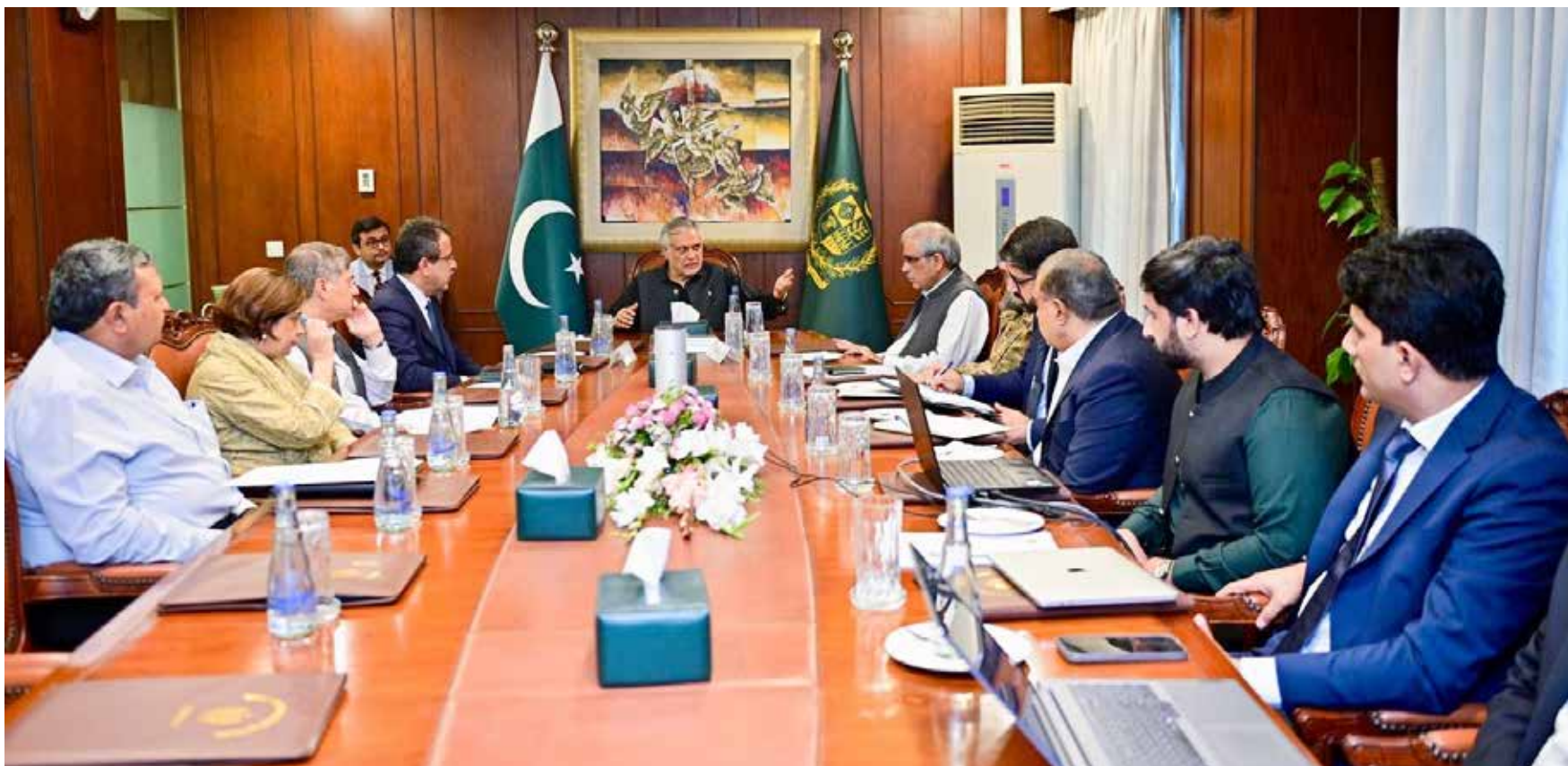
ISLAMABAD: Deputy Prime Minister/Foreign Minister, Senator Mohammad Ishaq Dar, chaired a high-level meeting to discuss challenges facing the power sector. The meeting was attended by Minister of Power, SAPM Tariq Bajwa, and other senior officials from Ministries of Power and Finance. – DNA

KARACHI: In its efforts to sell its struggling national airline, Pakistan has received expressions of interest from five parties, including business groups, the Privatisation Ministry said on Thursday. The bids were submitted ahead of a June 19 deadline to acquire up to 100% of PIA, which has accumulated over $2.5 billion in losses in roughly a decade. Still, following a major restructuring, it posted its first operating profit in 21 years in the year through June 2024. The sale is seen as a test of Pakistan's ability to shed loss-making state firms and meet conditions of a $7 billion International Monetary Fund bailout. It would be the country's first major privatisation in nearly two decades. Eight parties submitted their expression of interest, but only five of them provided documents of qualification, the ministry said in a statement.