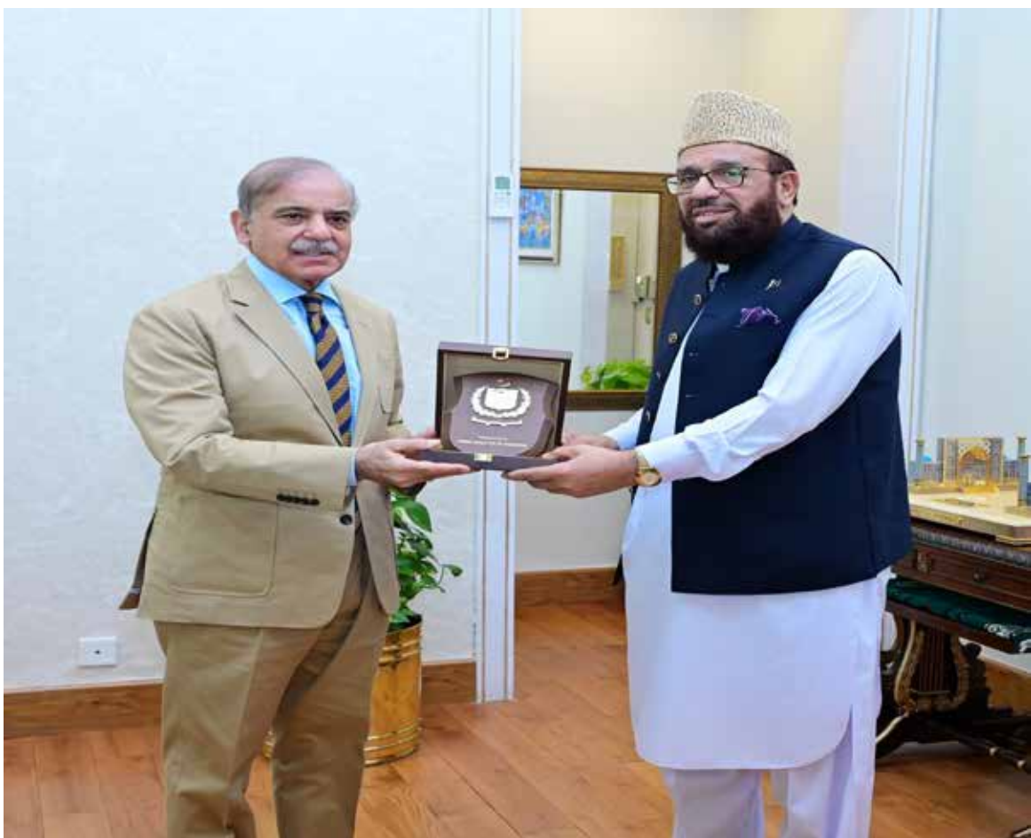
ISLAMABAD: Prime Minister Muhammad Shehbaz Sharif presenting a shield to Federal Minister for Religious Affairs Sardar Muhammad Yousaf to recognize his services for making best arrangements for Hajj 2025.