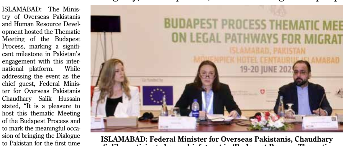
Salik, participated as a chief guest in 'Budapest Process Thematic Meeting on Legal Pathways for Migration'.

Minister Ch. Salik Hussain emphasized the importance of expanding safe, orderly, and regular avenues for migration, highlighting Pakistan's commitment to ensuring the dignity, development, and well-being of its people