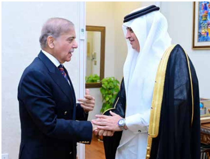
ISLAMABAD: Prime Minister Shehbaz Sharif met with Ambassador of Saudi Arabia Nawaf Saeed Al Maliki to discuss Middle East situation. – DNA