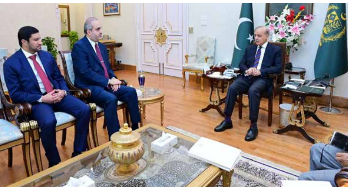
ISLAMABAD: Prime Minister Shehbaz Sharif met the Ambassador of Qatar to express our solidarity with His Highness the Amir and the brotherly people of Qatar following last night's attacks.