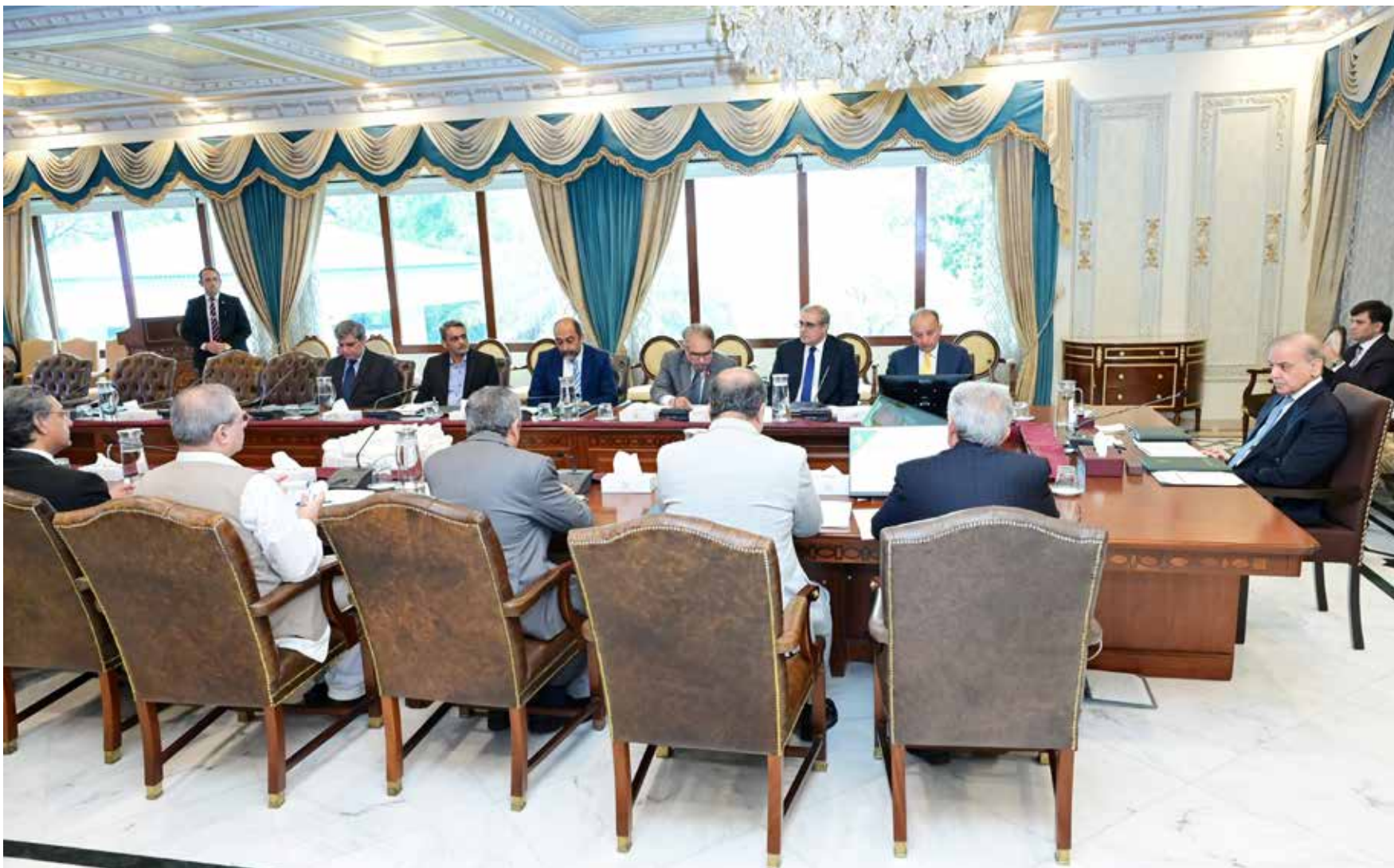
ISLAMABAD: Prime Minister Muhammad Shehbaz Sharif chairs a meeting regarding reforms in the Agricultural sector.

MINSK: Belarus and Cuba have identified promising points of growth in trade and economy, Belarusian President Aleksandr Lukashenko said as he was meeting with Cuban President Miguel Diaz-Canel Bermudez on 25 June, BELTA has learned. It was noted during the talks that Belarus-Cuba commission on trade and economic cooperation had established a schedule of regular, annual meetings. This shows mutual interest in deepening bilateral interaction. "Taking into consideration the complementarity of the economies of Belarus and Cuba, our experts have identified a number of promising points of growth in trade and economy.—APP