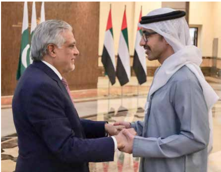
ABU DHABI: Deputy Prime Minister/Minister of Foreign Affairs of Pakistan, Senator Mohammad Ishaq Dar, received by Deputy Prime Minister and Minister of Foreign Affairs of the UAE, Sheikh Abdullah bin Zayed Al Nahyan.