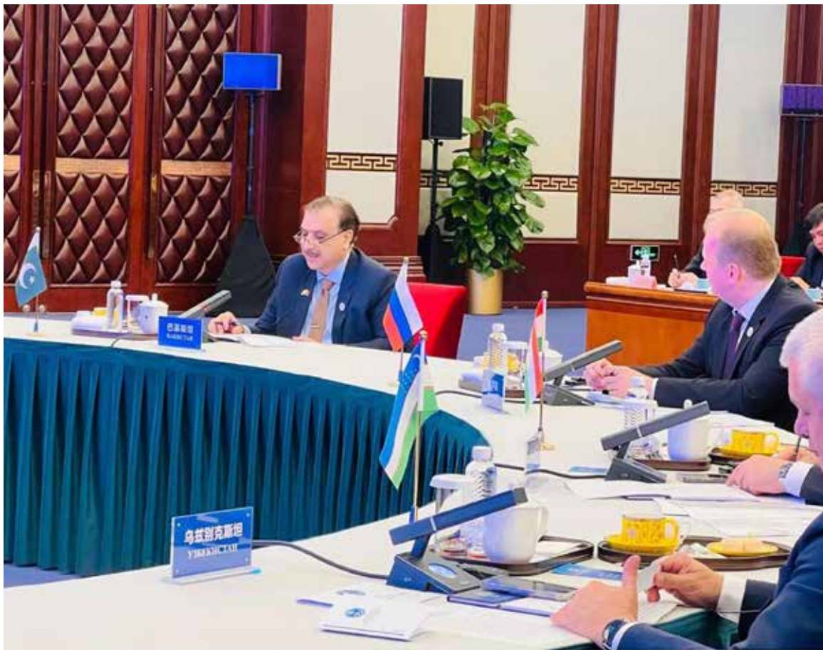
BEIJING, China: Lt. Gen Muhammad Asim Malik, National Security Advisor of Pakistan addressing the 20th meeting of the secretaries of the Security Council of Shanghai Cooperation Organization (SCO).