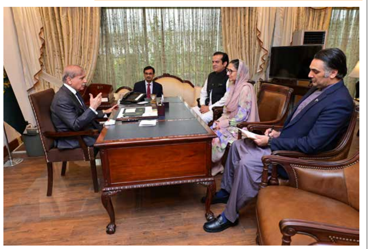
ISLAMABAD: Minister of State for Climate Change Ms. Shezra Mansub called on Prime Minister Muhammad Shehbaz Sharif .-DNA