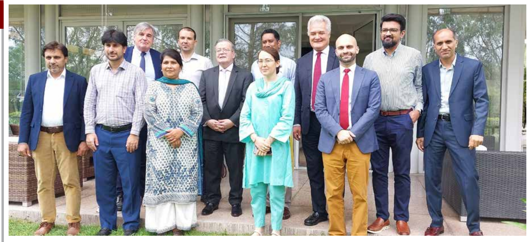
ISLAMABAD: The ambassador of France Nicolas GAley had the pleasure to host at the French Residence a group of representatives from 6 French NGOs active in Pakistan, and exchanged about their projects and key priorities: —DNA

ISLAMABAD: Indus River System Authority (IRSA) Thursday released 301,455 cusecs water from various rim stations with inflow of 434,613 cusecs. According to the data released by IRSA, the water level in River Indus at Tarbela Dam was 1473.88 feet which was 71.88 feet higher than the dead level of 1402.00 feet. Water inflow and outflow in the dam was recorded as 255,600 cusecs and 154,600 cusecs, respectively. The water level in River Jhelum at Mangla Dam was 1173.30 feet, which was 123.30 feet higher than its dead level of 1,050 feet.-APP