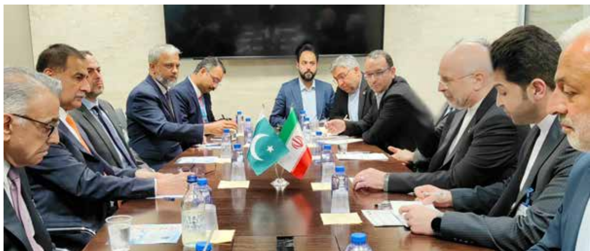
Geneva : Speaker National Assembly Sardar Ayaz Sadiq meeting with Speaker of the Parliament of Iran Mohammad Bagher Ghalibaf on the sidelines of the 6th World Conference of Speakers of Parliament.

at Rs165. Rana Tanveer noted that sugar prices in Pakistan are broadly aligned with those in neighboring countries: India (Rs150/kg wholesale), Bangladesh (Rs187), Afghanistan (Rs173), and Iran (Rs250). The minister added, Pakistan earned $402 million from the export of 750,000 metric tons of sugar last year. However, the minister acknowledged that earlier approval could have fetched higher export rates. To manage domestic availability, the government approved sugar imports of up to 500,000 metric tons, although only 300,000 tons are expected to be brought in, costing approximately $150 million. Downplaying the sugar issue as overblown, Rana Tanveer urged media and policymakers to shift their focus toward strategic national developments. "Our real priority should be landmark achievements such as the recent trade agreement with the United States," he said. He also highlighted broader signs of economic recovery, citing improved foreign exchange reserves, a rising Pakistan Stock Exchange, and declining inflation rates as indicators of better economic management.—DNA