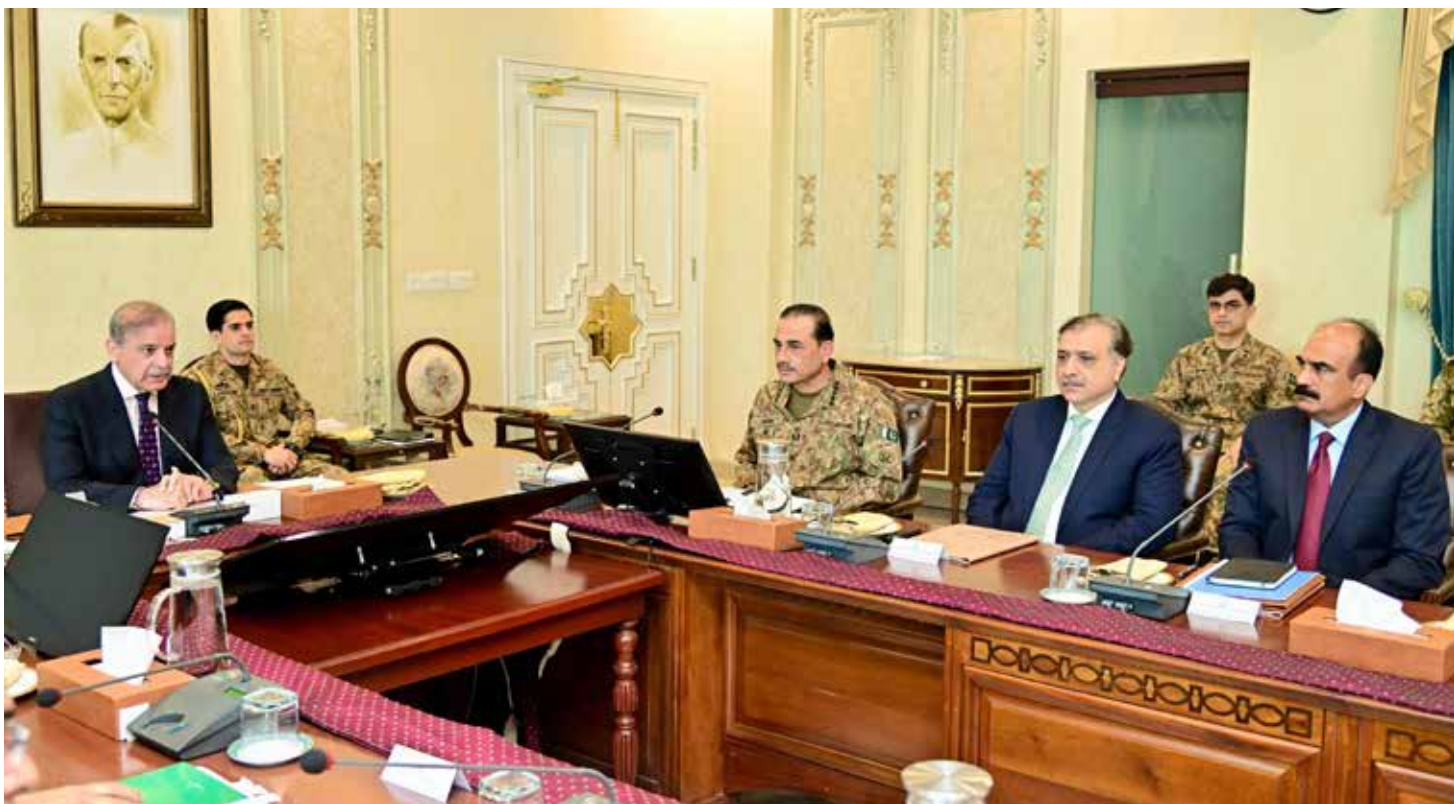
ISLAMABAD: Prime Minister chairs a high level meeting attended by Field Marshal Asim Munir, DG ISI and others.