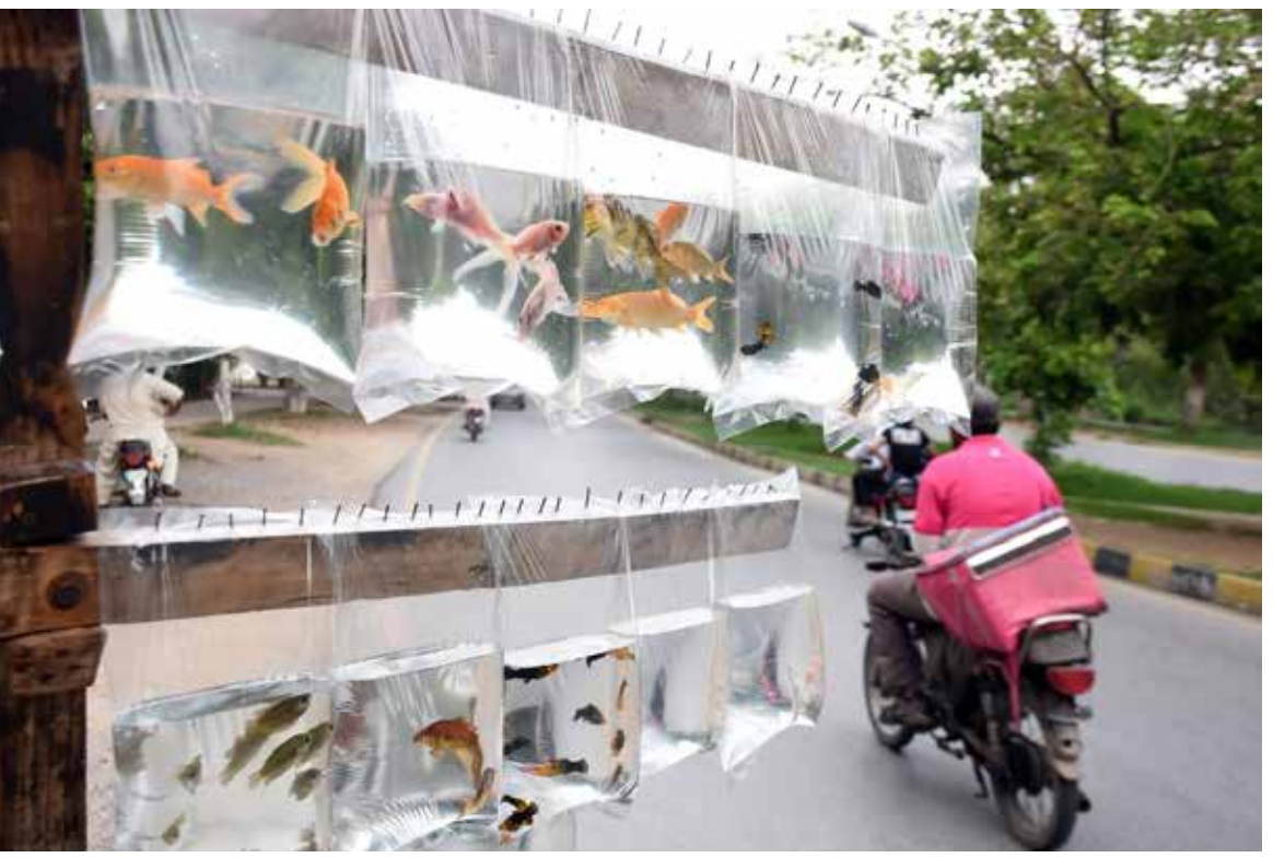
ISLAMABAD: A street vendor displays colorful fish attraction for costumers.

sal Service Fund (USF) has approved two major Optical Fiber Cable (OFC) projects worth over Rs5.65 billion, aimed at strengthening digital connectivity in Sanghar and Jhang districts According to an official, the two OFC projects will cover a total of 940 kilometers in Sanghar and Jhang districts. Once completed, they are expected to benefit around 2.8 million people, delivering high-speed internet to 113 towns and union councils. The Universal Service Fund (USF) has also approved seven major projects worth Rs7.49 billion to expand digital connectivity and high-speed internet access across 12 districts of Pakistan. The Sanghar project will lay 415 km of fiber optic cable, while the Jhang project will span 525 km. These initiatives aim to significantly enhance digital infrastructure and bring modern digital services to remote and underserved communities. In a separate decision, the USF Board also approved five broadband service projects worth Rs1.83 billion to extend 4G mobile services to over 0.965 million residents in 347 mauzas across 10 districts. These include Attock, Khushab, Sargodha, Bahawalpur, Faisalabad. Hafizabad. Sheikhupura, Chiniot, Badin, and Abbottabad.-APP