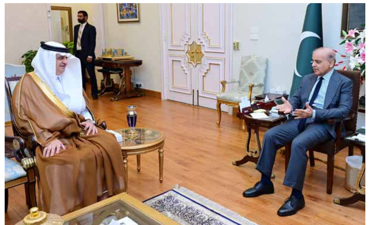
ISLAMABAD: Ambassador of the Kingdom of Saudi Arabia Nawaf bin Saeed al Malikiy called on Prime Minister Muhammad Shehbaz Sharif in Islamabad on 2 July 2025.