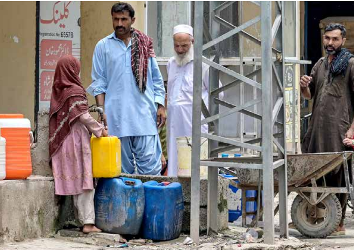
ISLAMABAD: Residents of Tarlai area fetching drinking water from a nearby Naan shop due to insufficient supply of water in the area.