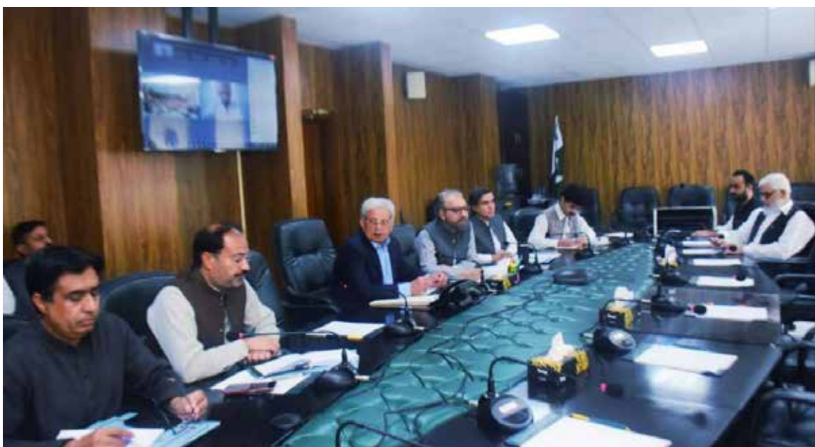
Islamabad: Federal Minister for National Food Security and Research, Rana Tanveer Hussain, chairs meeting to review measures for enhancing cotton yield across the country.

needs met. He warned that the continuing blockade on fuel deliveries, now entering an 18th week, threatens to bring remaining humanitarian operations to a halt. "Without an urgent influx of fuel, incubators will shut down, ambulances will be unable to reach the injured and sick, and water cannot be purified," he said, adding that the UN and its partners might soon be unable to deliver even the limited amount of aid that remains in Gaza. Guterres repeated his call for "full, safe and sustained humanitarian access," and said the UN has a ready, proven plan to deliver aid "safely and at scale" to civilians across the territory. He also renewed his appeal for an "immediate, permanent ceasefire" and the "immediate and unconditional release of all hostages," and stressed that all parties involved in the conflict must uphold their obligations under international law.—Agencies