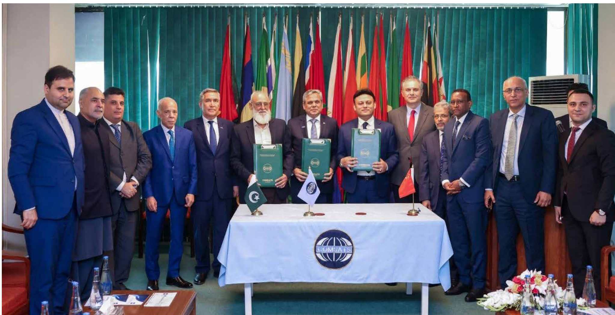
ISLAMABAD: Tripartite MoU Signing Ceremony at COMSATS. Ambassadors of Syria, Morocco, Jordan, Yemen, Ethiopia and a diplomat from the Azerbaijan embassy took part in the MoU signing ceremony.