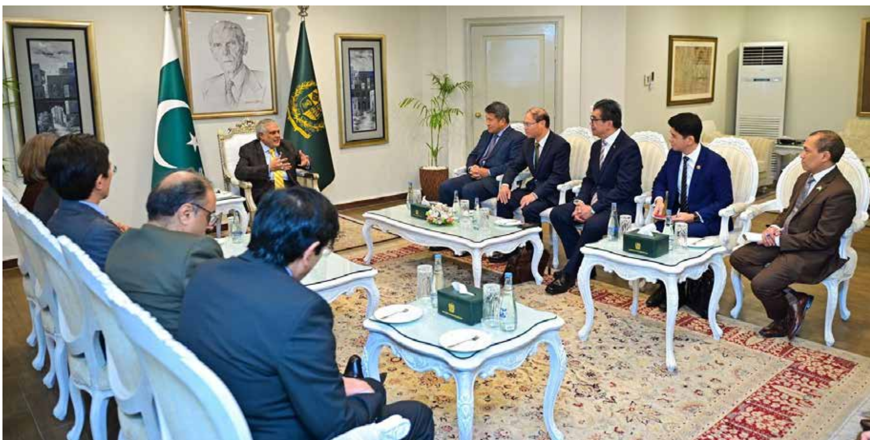
ISLAMABAD: ASEAN Heads of Missions in Pakistan including Myanmar, Brunei Darussalam, Vietnam, Thailand, Philippines, Malaysia, and Indonesia called on the Deputy Prime Minister/Foreign Minister, Senator Mohammad Ishaq Dar ahead of his participation in the 32nd ARF Ministerial Meeting later this week. They reaffirmed the importance of Pakistan's partnership with ASEAN and its member states. — DNA

BRUSSELS: EU ministers are set to give the final green light on Tuesday for Bulgaria to adopt the euro on January 1, 2026, when the country would become the single currency area's 21st member. The European Commission last month said the EU's poorest country had fulfilled the strict conditions to adopt the euro, while the European Central Bank (ECB) also gave a positive opinion. Bulgaria's switch from the lev to the euro next year will come 19 years after the country of 6.4 million people joined the European Union. Today is truly an important day for Bulgaria. — APP