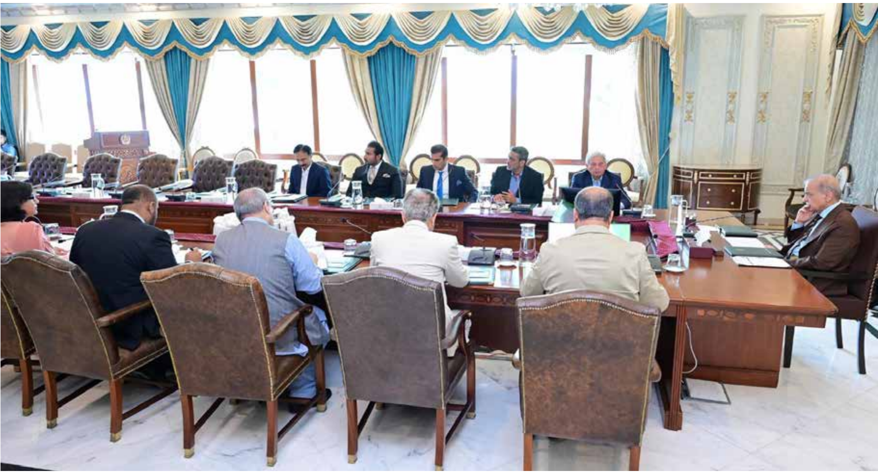
ISLAMABAD: Prime Minister Shehbaz Sharif chairs a meeting regarding matters pertaining to the Agriculture sector.