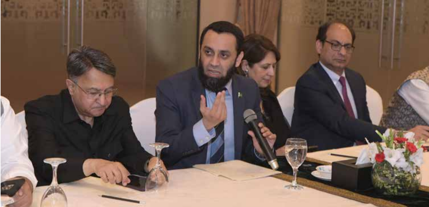
ISLAMABAD: Federal Information Minister Attaullah Tarar hosted dinner in honour of the Members of the APNS Executive Committee. Tarar assured to resolve genuine issues faced by the print media industry.