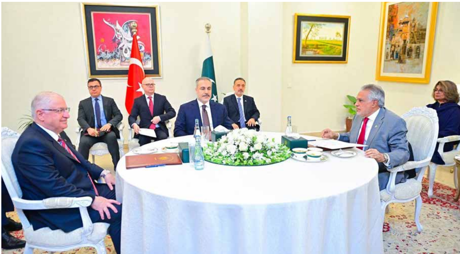
ISLAMABAD: Deputy Prime Minister and Foreign Minister, Senator Mohammad Ishaq Dar, held a meeting with Minister of Foreign Affairs of Turkiya, Hakan Fidan and the Minister of National Defence of Turkiya, Yasar Guler, co-chair of Joint Ministerial Commission at FoFA. – DNA

FROM PAGE 01 people of Pakistan but India does not want it to materialise. He said that India wants the power differential between the two countries keep on increasing so that the it can act as "a regional hegemon and a bully" who can dictate its own terms. This is the biggest strategy New Delhi has, he added. The DG ISPR said that there was not one face of Indian terrorism. "Indian terrorism in Pakistan has multiple faces," he added. Highlighting the forms of Indian-sponsored terrorism in Pakistan, the general accentuated the transnational killings carried out by New Delhi and pointed out towards Research & Analysis Wing (RAW) operatives and handler.