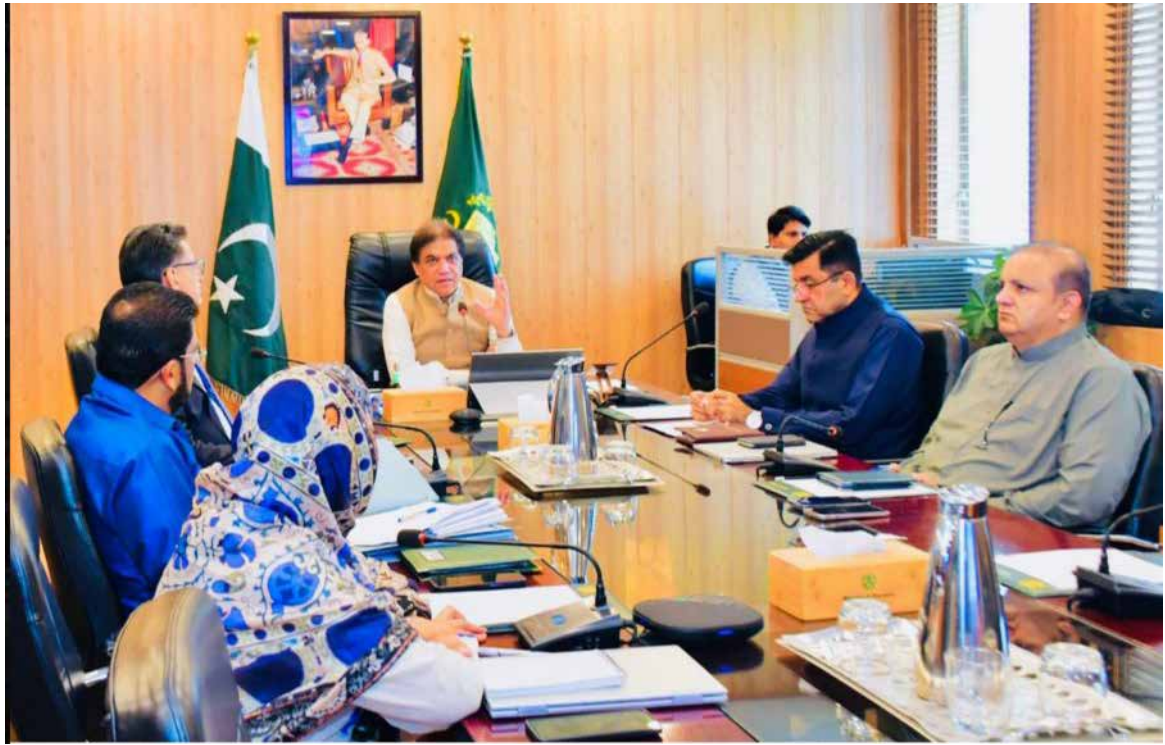
ISLAMABAD: Federal Minister for Railways, Muhammad Hanif Abbasi chaired a high-level meeting to review railway performance, mechanical operations, and improvement measures.

ly, 70,977 furniture sets have been delivered to improve classroom environments. CM Maryam Nawaz Sharif also launched the Punjab Education Endowment Fund (PEEF) Education Tech Schools as a pilot project and directed that similar schools be expanded to rural areas. A successful English Conversation Program, aligned with IELTS Standard-4, is underway to benefit 300,000 students within six months. So far, 10,000 classrooms for Early Childhood Education have been prepared across Punjab. The Chief Minister also directed the expansion of the Nawaz Sharif Center of Excellence, increasing its intake from 240 to 1,500 students. The School Meal Program is set to begin in Dera Ghazi Khan, Layyah,