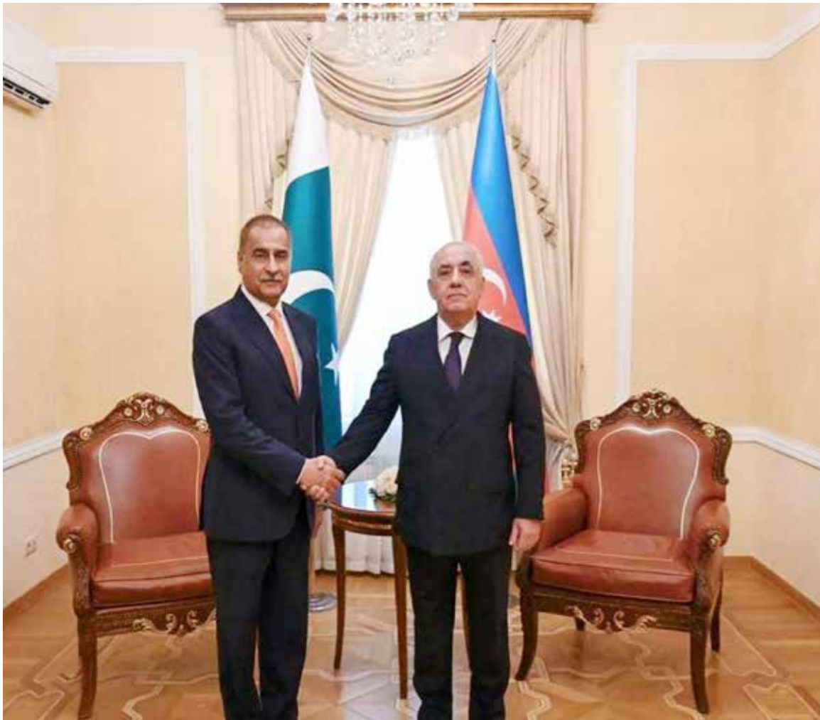
Baku: Speaker National Assembly Sardar Ayaz Sadiq shaking hand with the Prime Minister of Azerbaijan Ali Asadov at Cabinet of Ministers.

BAKU: The leaders of Armenia and Azerbaijan will meet on Thursday in the United Arab Emirates for peace talks, two days after the US expressed hope for a swift deal. Baku and Yerevan fought two wars over the disputed Karabakh region, which Azerbaijan recaptured from Armenian forces in a lightning offensive in 2023, prompting the exodus of more than 100,000 ethnic Armenians. The arch foes agreed on the text of a comprehensive peace deal in March, but Baku has since outlined a host of demands – including amendments to Armenia's constitution to drop its territorial claims for the Karabakh – before signing the document. On Wednesday, the Armenian government said Prime Minister Nikol Pashinyan and Azerbaijani President Ilham Aliyev will meet the following day in the UAE capital, Abu Dhabi, “within the framework of the peace process between Armenia and Azerbaijan.” The Azerbaijani presidency issued an identical statement. —APP