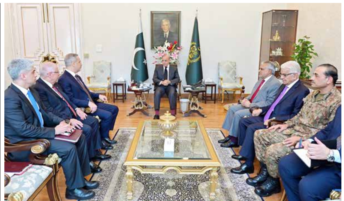
ISLAMABAD: Minister for Foreign Affairs of the Republic of Türkiye, Hakan Fidan and Minister for National Defence of the Republic of Türkiye Yasar Güler calls on Prime Minister Muhammad Shehbaz Sharif.