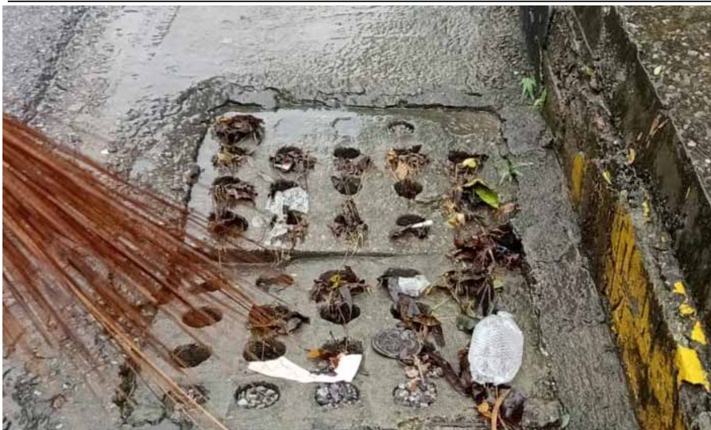
ISLAMABAD: CDA staff engaged in clearing drainage channels to prevent rainwater accumulation on roads.

ISLAMABAD: The China Civil Engineering Construction Corporation (CCECC) has successfully completed excavation of the fifth tunnel on the relocated portion of the Karakoram Highway, also known as the China-Pakistan Friendship Highway. The Dogah Tunnel is one of the seven tunnels in Phase 1 of the relocated highway, KKH-01. The highway is being relocated because a 46-kilometre stretch of the existing road will be submerged in the Dasu Dam, which is currently under construction in Khyber Pakhtunkhwa (KP) Province. The tunnel, with a total length of 1,242 meters, represents a critical advancement in strengthening regional connectivity and infrastructure development, a senior engineer involved in the construction of the project wrote. The breakthrough was achieved on July 14, a source said. He added that excavation of the remaining two tunnels will be achieved within two months. The total length of the relocated KKH will be 62 kilometres, according to the Water and Power Development Authority (WAPDA). The relocated KKH has been divided into two Phases i.e., KKH-01 and KKH-02. Phase 1 (KKH-01) will serve as a bypass to avoid interference in construction activities at the dam site. —APP