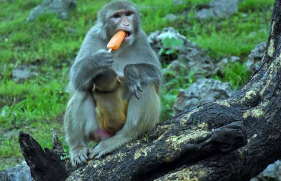
ISLAMABAD: A female monkey sit on a tree along with her child at Damn-e-Koh as eating Ice cream during pleasant weather after the rain, in the Federal Capital.