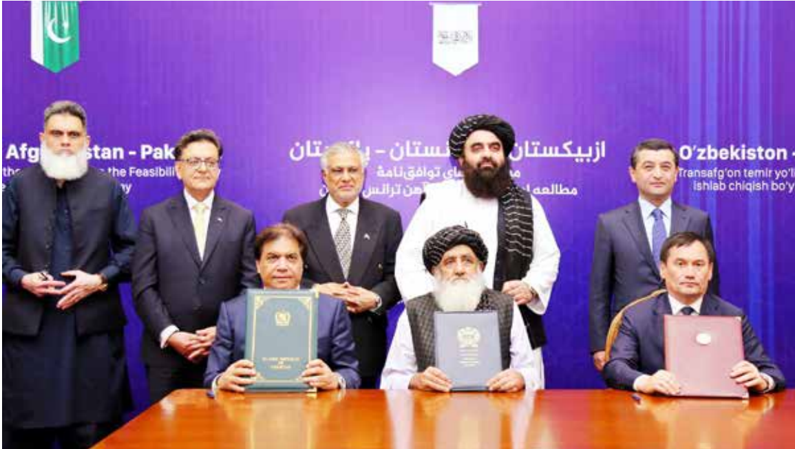
KABUL: Deputy Prime Minister / Foreign Minister along with the Foreign Ministers of Afghanistan and Uzbekistan, held a trilateral meeting in Kabul ahead of the signing of the Framework Agreement on the Joint Feasibility Study for Uzbek-Afghan-Pak (UAP) Railway project. Afterwards they witnessed the signing ceremony. – DNA