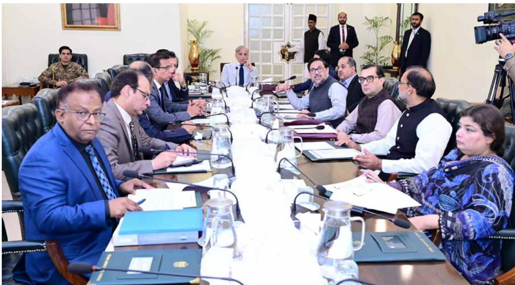
ISLAMABAD: Prime Minister Muhammad Shehbaz Sharif chairs a meeting on encouraging usage of electric vehicles in country.