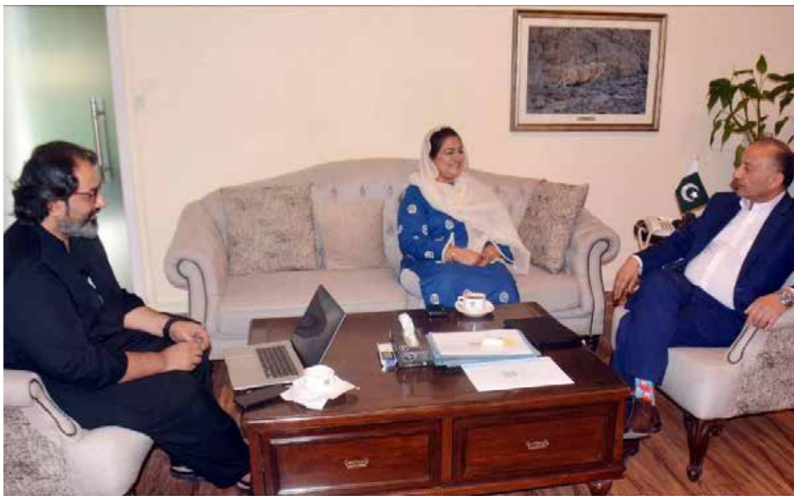
ISLAMABAD: Federal Minister for Climate Change and Environmental Coordination, Dr. Musadik Malik, met with Parliamentary Secretary for the Ministry of Defense, Ms. Zeb Jaffer, along with several emerging green startups working on clean energy and carbon credits.

Republic of Northern Cyprus, declared in 1983, is recognized only by Ankara. The internationally recognized Republic of Cyprus, a member of the European Union, controls the island's majority Greek Cypriot south. The last major round of peace talks collapsed in Crans-Montana, Switzerland, in July 2017. "I think we are building, step-by-step, confidence and creating conditions to do concrete things to benefit the Cypriot people," Guterres said in remarks to reporters. —Agencies