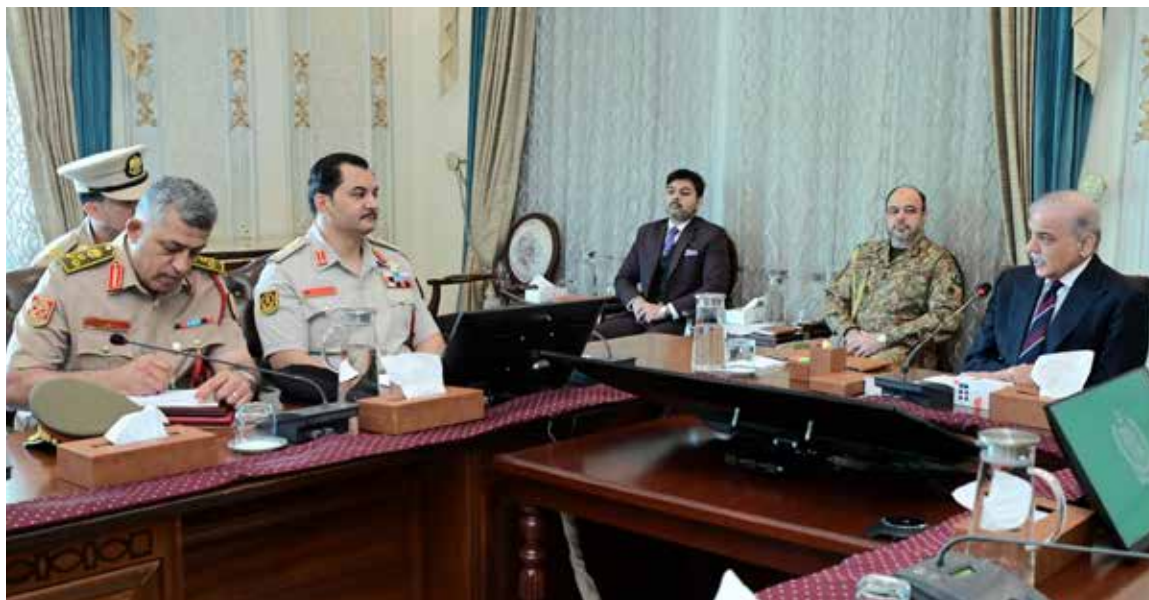
ISLAMABAD: Commander-in-Chief of Libyan Armed Forces Lt. General Saddam Khalifa Abu Qasim Haftar calls on Prime Minister Muhammad Shehbaz Sharif, on 18 July, 2025 in Islamabad.