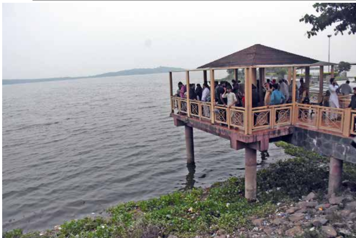
ISLAMABAD: People visiting Lake View Park to enjoy pleasant weather.