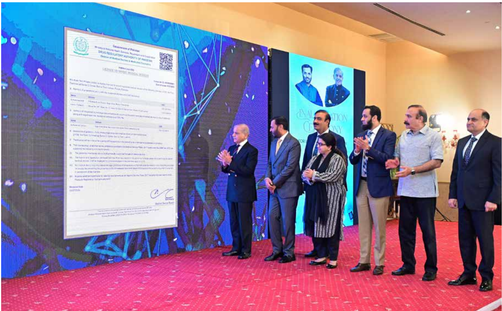
Islamabad: Prime Minister Muhammad Shehbaz Sharif inaugurates the digital system for licensing and registration of medical devices.