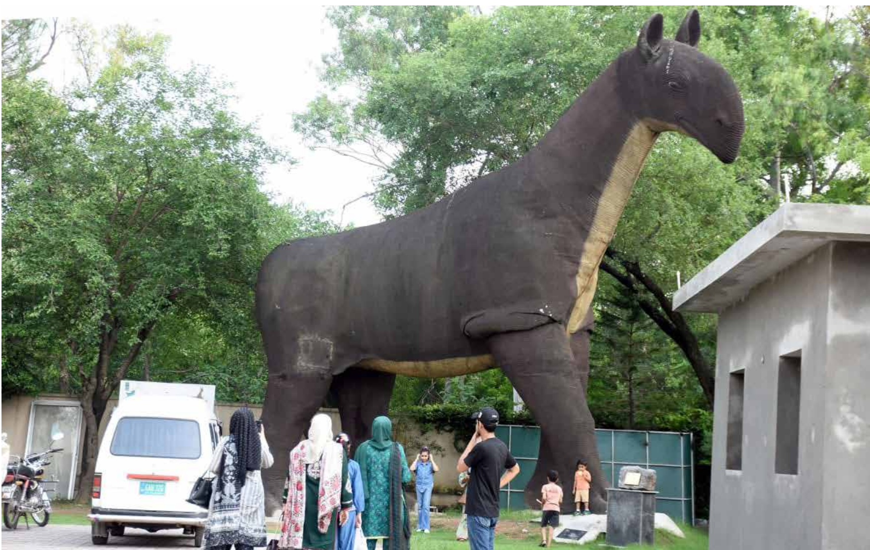
ISLAMABAD: Visitors looking life-sized Baluchitherium sculpture during visiting at Pakistan Museum of Natural History.