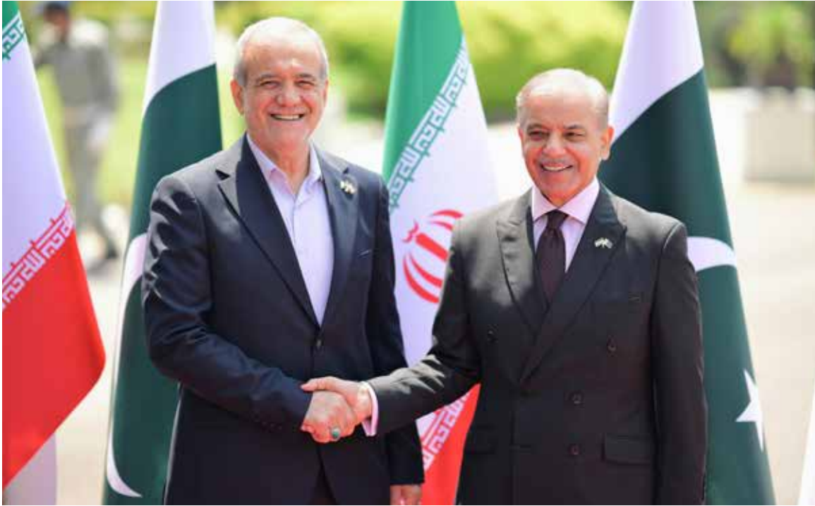
ISLAMABAD: Prime Minister Muhammad Shehbaz Sharif receives the President of Iran H.E. Dr. Masoud Pezeshkian at the Prime Minister's House in Islamabad on 3 August 2025.