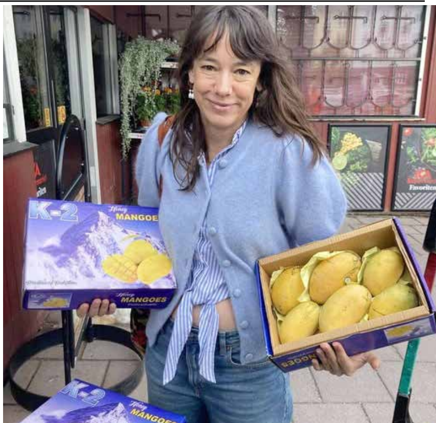
STOCKHOLM: Swedish Ambassador to Pakistan was trilled to find Pakistani mangoes in her village store in Sweden. DNA

ISLAMABAD: The exports of tobacco witnessed an increase of 158.31 per cent during the fiscal year 2024-25, as against the exports of the last year 2023-24. The tobacco exports from the country were recorded at US $166.527 million during July-June (2024-25) against the exports of US $64.468 million during July-June (2023-24), according to the Pakistan Bureau of Statistics (PBS). In terms of quantity, the exports of tobacco also surged by 140.18 per cent going up from 43,520 metric tons to 18,282 metric tons, according to the data. Meanwhile, year-on-year basis, the export of tobacco also went up by 303.92 per cent during the month of June 2025 as compared to the same month of last year.—APP