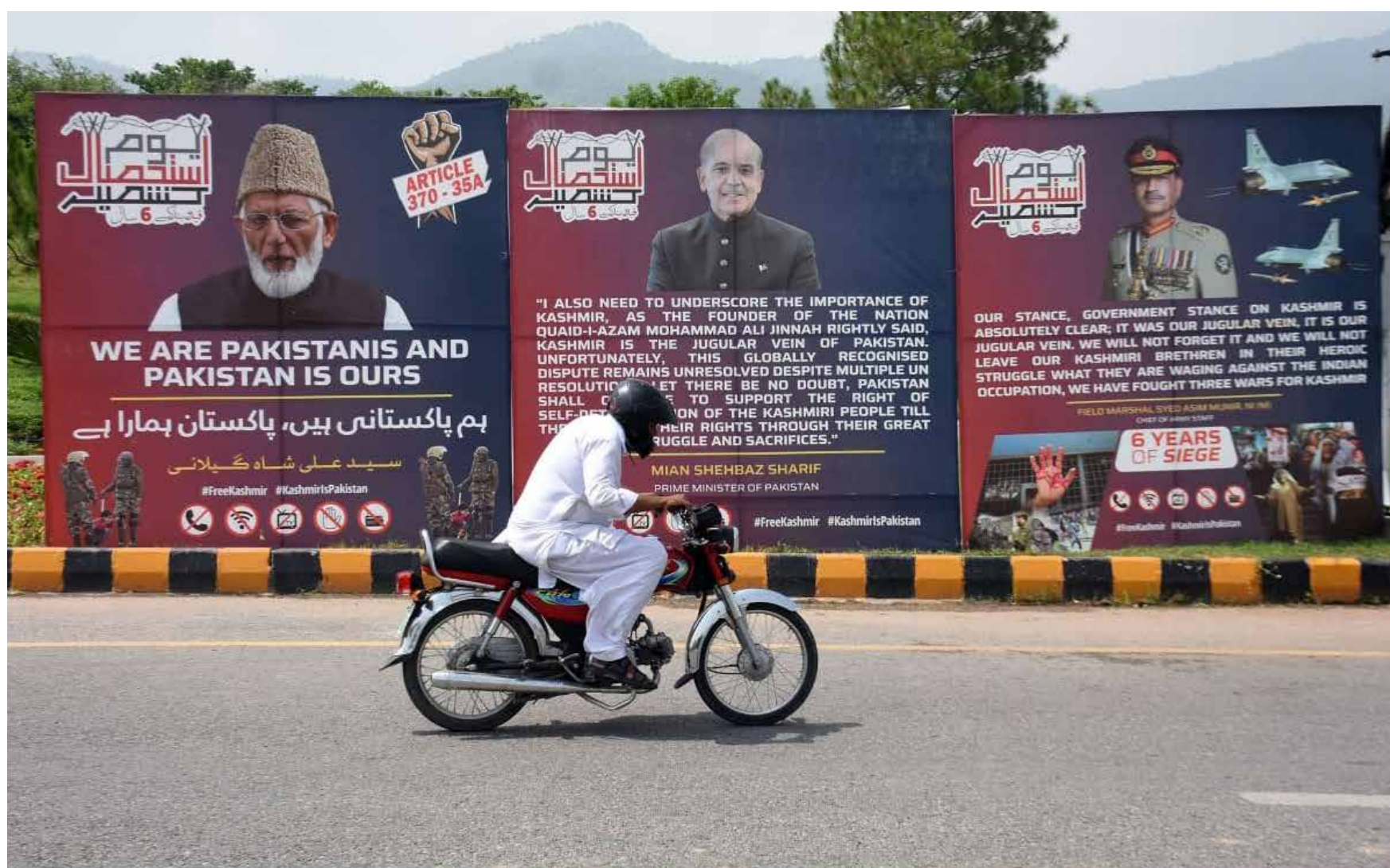
ISLAMABAD: Banners displayed in connection with Youm-e-Istehsal Muqbuza Kashmir along the Constitution Avenue in Federal Capital.