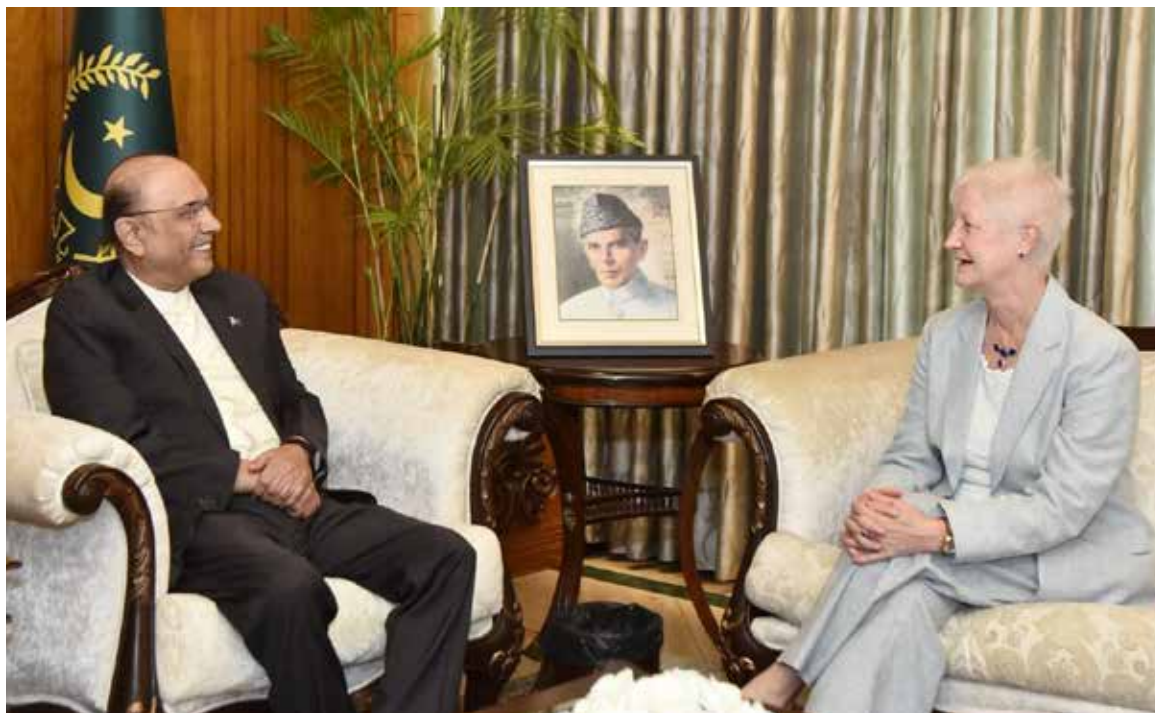
ISLAMABAD: Outgoing Head of the European Union delegation to Pakistan, Dr. Riina Kionka, called on President Asif Ali Zardari at Awan-e-Sadr.