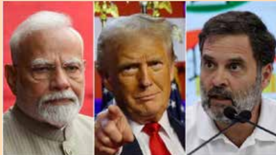
NEW DELHI: In a scathing criticism of alleged dubious dealings of the Indian prime minister, country's opposition leader Rahul Gandhi has said the reason Narendra Modi

"One threat is to expose financial links between Modi, AA, and Russian oil deals," says Indian opposition leader