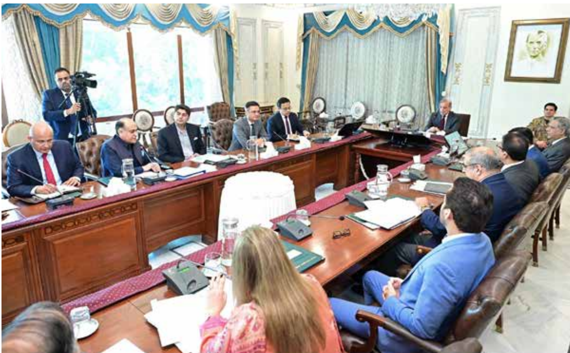
ISLAMABAD: Prime Minister Muhammad Shehbaz Sharif chairs a meeting to review progress regarding Jinnah Medical Complex.