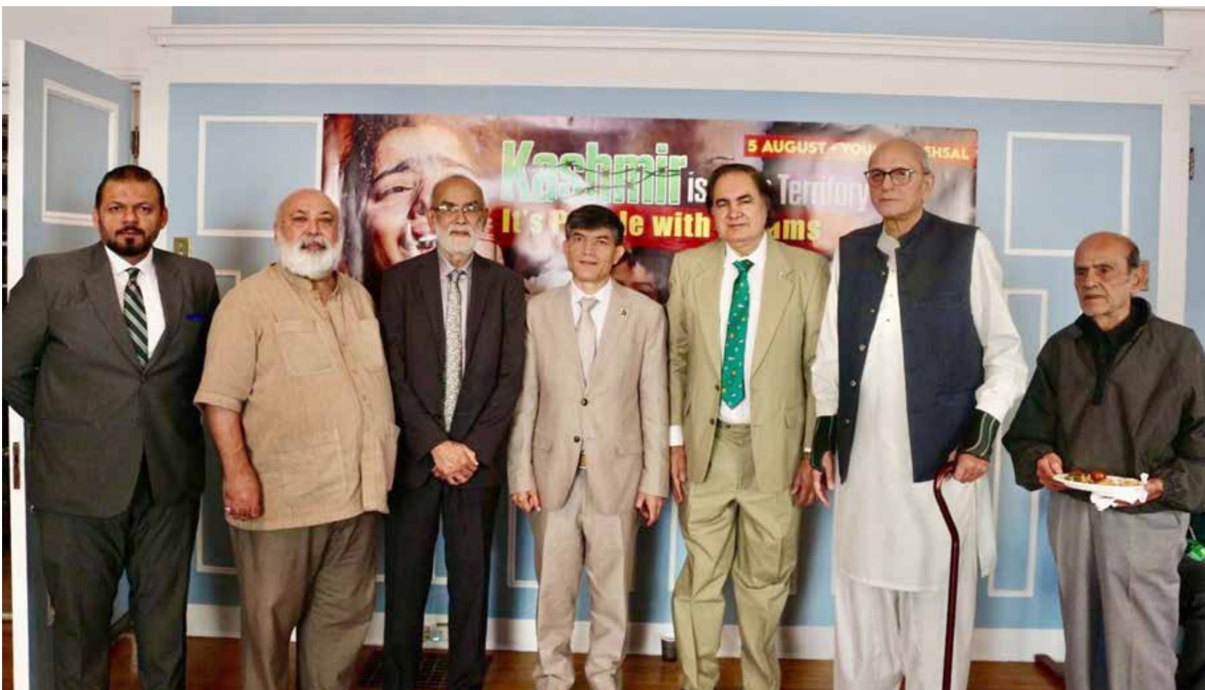
Ottawa, Canada: Pakistan High Commissioner Muhammad Saleem with Pakistani community members on Yaum-e-Istehsal

ISLAMABAD: The Securities and Exchange Commission of Pakistan (SECP) has achieved a historic milestone by registering a record 4,065 companies in July 2025—the highest monthly registrations to date, surpassing the previous record of 3,609 set in May 2025. With 99.9% of incorporations processed digitally, the total number of registered companies in Pakistan now stands at 262,309, said a press release. The total paid-up capital for July 2025 amounted to Rs. 4.96 million. Private limited companies accounted for 57% of new registrations, followed by single-member companies at 39%. The remaining 4% comprised public unlisted companies, not-for-profit organizations, companies limited by guarantee, and limited liability partnerships. The Information Technology and e-commerce sectors led with 862 new incorporations, followed by trading (530), services (468), and real estate development and construction (398). Other active sectors included tourism and transport (295), food and beverages (203), education (148), marketing and advertisement (98), mining and quarrying (95), textiles (91), pharmaceuticals (86), agricultural farming (74), engineering (64), cosmetics and toiletries (59), and chemicals and healthcare (56). An additional 482 companies were registered across other sectors, including fuel and energy, non-profits under Section 42, auto and allied, power generation, and communications. Foreign investment also showed positive momentum—APP