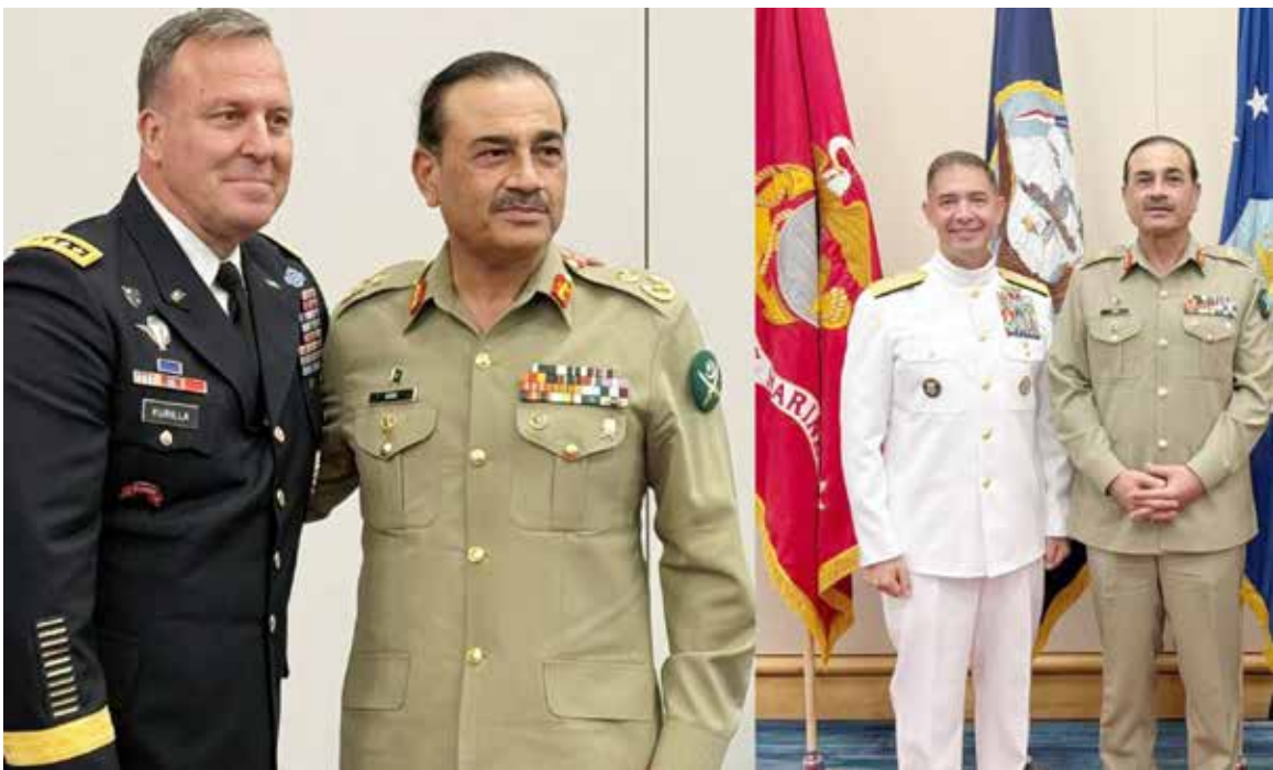
WASHINGTON: Field Marshal Asim Munir posing for a picture with the outgoing Commander United States Central Command (Centcom), General Michael E Kurilla, and the incoming Commander Admiral Brad Cooper.

contribute to attracting investments. The visit follows an earlier official trip to the United States in June, during which Field Marshal Munir met President Donald Trump over a luncheon. During the meeting, which extended to over two hours, both sides also discussed avenues for expanding bilateral cooperation in multiple domains, including trade, economic development, mines and minerals, artificial intelligence, energy, cryptocurrency, and emerging technologies. Following the army chief's visit, Pakistan and Washington have since then reached a much-awaited trade agreement as well. The trade deal was confirmed by Trump himself who took to social media, saying that the two countries will "work together on developing their massive oil reserves" and were currently "in the process of choosing the oil company" which will be leading this partnership. President Asif Ali Zardari, back in July, conferred the Nishan-e-Imtiaz (Military) upon Centcom commander Gen Kurilla in recognition of his exceptional services for regional peace and efforts to bolster Pakistan-US defence cooperation. During his visit, General Kurilla held detailed meetings with senior Pakistani civil and military leadership, including President Zardari and Chief of Army Staff (COAS) Field Marshal Syed Asim Munir. The discussions encompassed regional security, military-to-military engagement, and joint efforts to combat terrorism and emerging transnational threats.