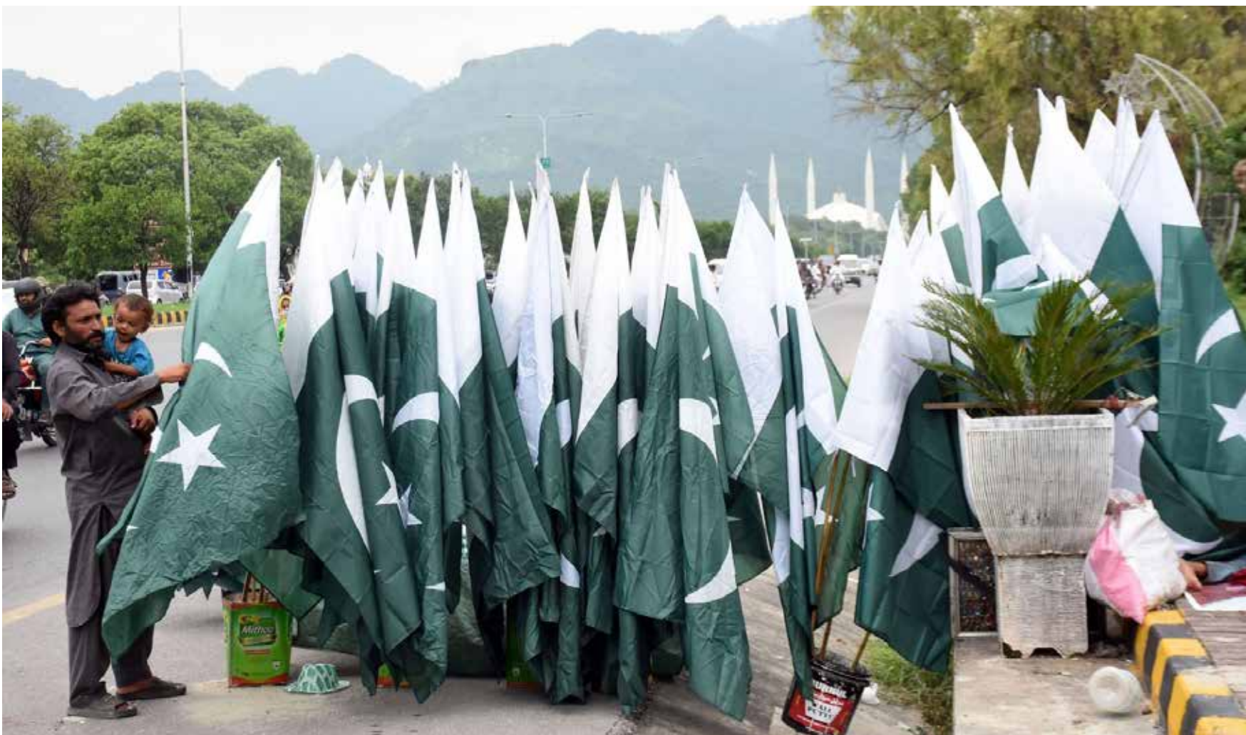
ISLAMABAD: A street vendor display National Flags along the road side to attract the customers during the month of Independence Day in Federal Capital.