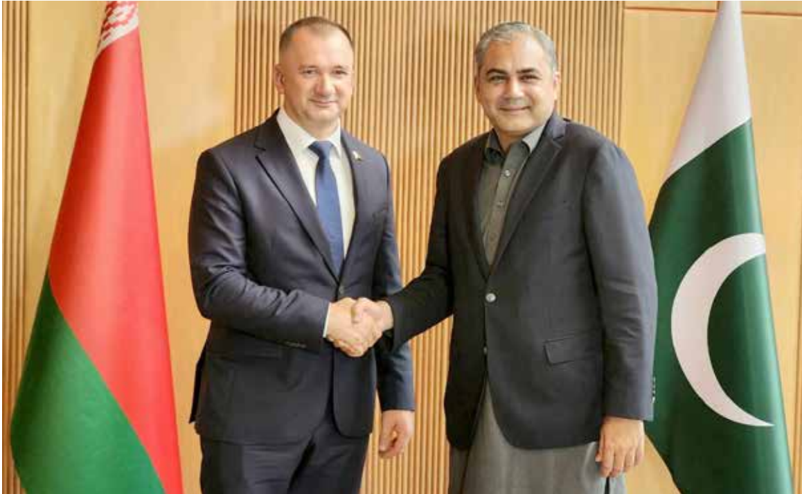
ISLAMABAD: Belarusian Interior Minister Ivan Kubrakov visited Ministry of Interior, Federal Interior Minister Mohsin Naqvi welcomed the Honorable guest on his arrival.

Ethiopian airforce chief calls on PAF chief