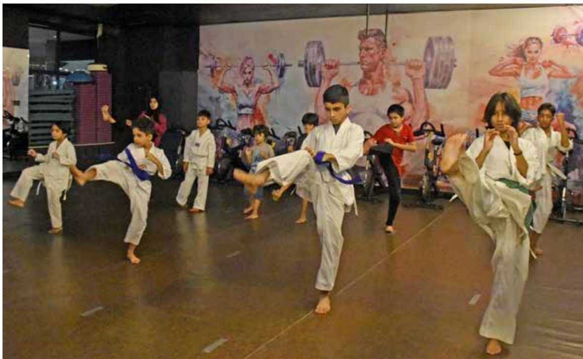
ISLAMABAD: Younger children are demonstration Martial Arts at local gym of F-9 Park in Federal Capital.

FORMER Bayern Munich striker Thomas Muller has confirmed changing his opinion on the greatest of all time (GOAT) debate involving Argentinian star Lionel Messi and Portugal legend Cristiano Ronaldo. Messi and Ronaldo, with 13 Ballon d'Ors between them, are widely regarded as the two greatest footballers in history. Yet the debate over who deserves the title of GOAT remains alive as both approach the twilight of their glittering careers. Currently, Ronaldo has 36 trophies – 10 fewer than Messi. The Argentine's 2022 World Cup triumph often takes center stage when comparing the two, given its significance on the global stage. Muller admitted that the World Cup swayed his stance, saying he once leaned toward Ronaldo but switched after Argentina's triumph in Qatar. "Lionel Messi is the GOAT. In my first 10 years as a professional player, I would have chosen Cristiano Ronaldo, but since 2022 World Cup with Argentina, it's been Messi for me."