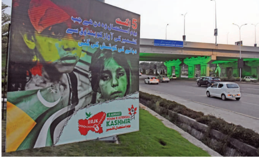
ISLAMABAD: Banner displayed in connection with Youm-e-Istehsal Kashmir along the Express Way in Federal Capital.

ISLAMABAD: Senior leader of the All Parties Hurriyat Conference (APHC) and former Information Secretary Intiaz Wani on Monday said that August 5 is one of the darkest and most painful turning points in the modern history of Jammu and Kashmir. He described the day as a symbol of India's aggressive and unlawful actions aimed at dismantling the disputed region's constitutional, legal, and historical status. In a statement issued on the eve of Youm-e-Istehsal (Exploitation Day), Wani condemned the Indian government's move to revoke Articles 370 and 35A, which granted Jammu and Kashmir limited autonomy under the Indian constitution. He stated that the revocation was a unilateral, unconstitutional, and illegal step carried out under the Modi government's Hindutva ideology. This act was not only an attack on Kashmir's identity but a blatant violation of international law, United Nations resolutions, and universally recognized human rights, Wani said. The APHC leader said the subsequent bifurcation of the region into two union territories under New Delhi's direct control reflected India's colonial ambitions and complete disregard for the aspirations and rights of the Kashmiri people. "The aftermath of this decision effectively turned occupied Kashmir into an open-air prison," he added.—APP