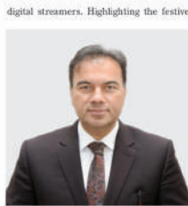
plans, he said that a series of publiccen-

In line with the directions of Federal Interior Minister Mohsin Naqvi, preparations are being jointly carried out by the CDA, Islamabad Administration, and Metropolitan Corporation Islamabad (MCI) to mark August 14 in a befitting and dignified manner. Randhawa told media that the city will be festooned with national flags, and all government buildings will prominently display patriotic colors. Key roads such as Constitution Avenue, Srinagar Highway, Club Road, and Jinnah Avenue will be illuminated with decorative LED lights and