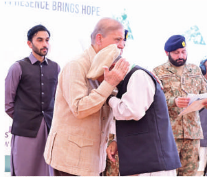
GILGIT: Prime Minister Shehbaz Sharif distributing compensation cheques among the flood-hit people, during his recent visit to Gilgit-Baltistan.