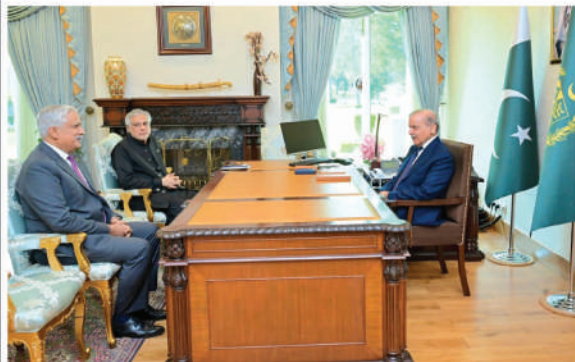
ISLAMABAD: Chairman WAPDA Lt. Gen. (R) Muhammad Saeed called on Prime Minister Muhammad Shehbaz Sharif.

According to a press release issued here Monday, the Chief Justice of the High Court of Sindh apprised the Chief Justice of Pakistan regarding the proposed construction of a state-of-the-art Judicial Complex in Karachi, comprising 125 fully equipped courts along with all requisite amenities. The project is intended to address the growing needs of the judicial system in Karachi and is expected to commence shortly. The Chief Justice of Pakistan welcomed the initiative and underscored the importance of sustainable, scalable, and forward-looking infrastructure planning. He stressed that future forecasting must be integrated into the design to ensure the long-term viability of the complex. In this regard, he recommended that structured consultations be held with all relevant stakeholders, including judges and members of the district bar, to gather practical input keeping in view the technicalities so that a refined proposal may be placed before the government for timely execution. —APP