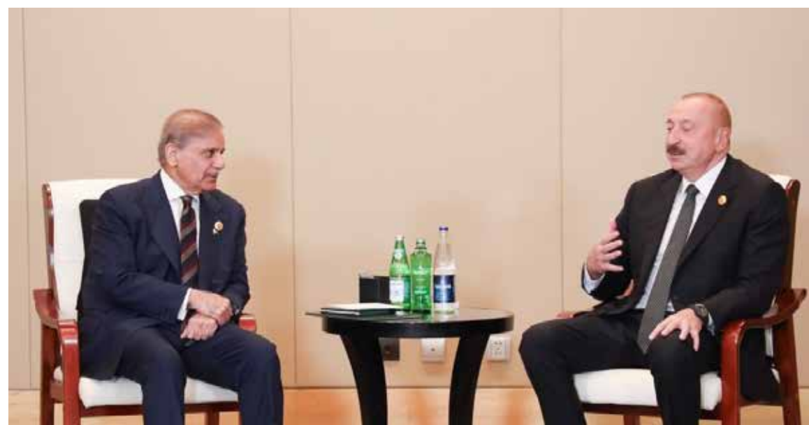
TIANJIN: Prime Minister Muhammad Shehbaz Sharif meets with President of Azerbaijan Ilham Aliyev on the sidelines of the SCO Council of Heads of State.

partner. The Prime Minister welcomed Lao People's Democratic Republic as new Dialogue Partner of SCO. He also welcomed President Xi Jinping's Global Governance Initiative and appreciated the able Chinese Chairmanship of SCO during last one year. On the sidelines of these Summits, the Prime Minister had important bilateral meetings with the Presidents of SCO member States and Dialogue Partners States. Issues of mutual interest and matters relating to further strengthening political, economic and trade relations were discussed by the leaders. Since becoming full member of SCO in 2017, Pakistan has actively and constructively participated in all SCO activities and mechanisms as well as extended all out cooperation towards achieving SCO's multi-sectoral agenda. Pakistan hosted the SCO Council of Heads of Government (CHG) meeting in Islamabad in 16-17 October last year. CHS is the highest decision-making forum in SCO. It gives strategic, political and security direction to the Organization. The SCO CHS adopts declarations, statements, and important decisions, etc.