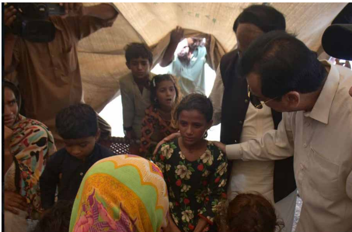
MULTAN: Chairman Senate Yusuf Raza Gilani listening to the problems of flood affectees at a relief camp