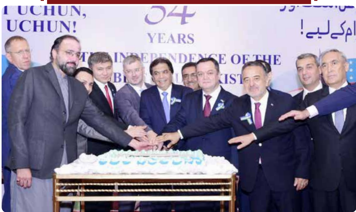
ISLAMABAD: Chief Guest Hanif Abbasi Minister for Railways, Salik Hussain Federal Minister for Overseas Pakistanis, Ambassador of Uzbekistan Alisher Tukhtaev, heads of missions of the Central Asian states and others cutting cake to celebrate the 34th Anniversary of the Independence Day of the Republic of Uzbekistan, at Islamabad Serena Hotel.