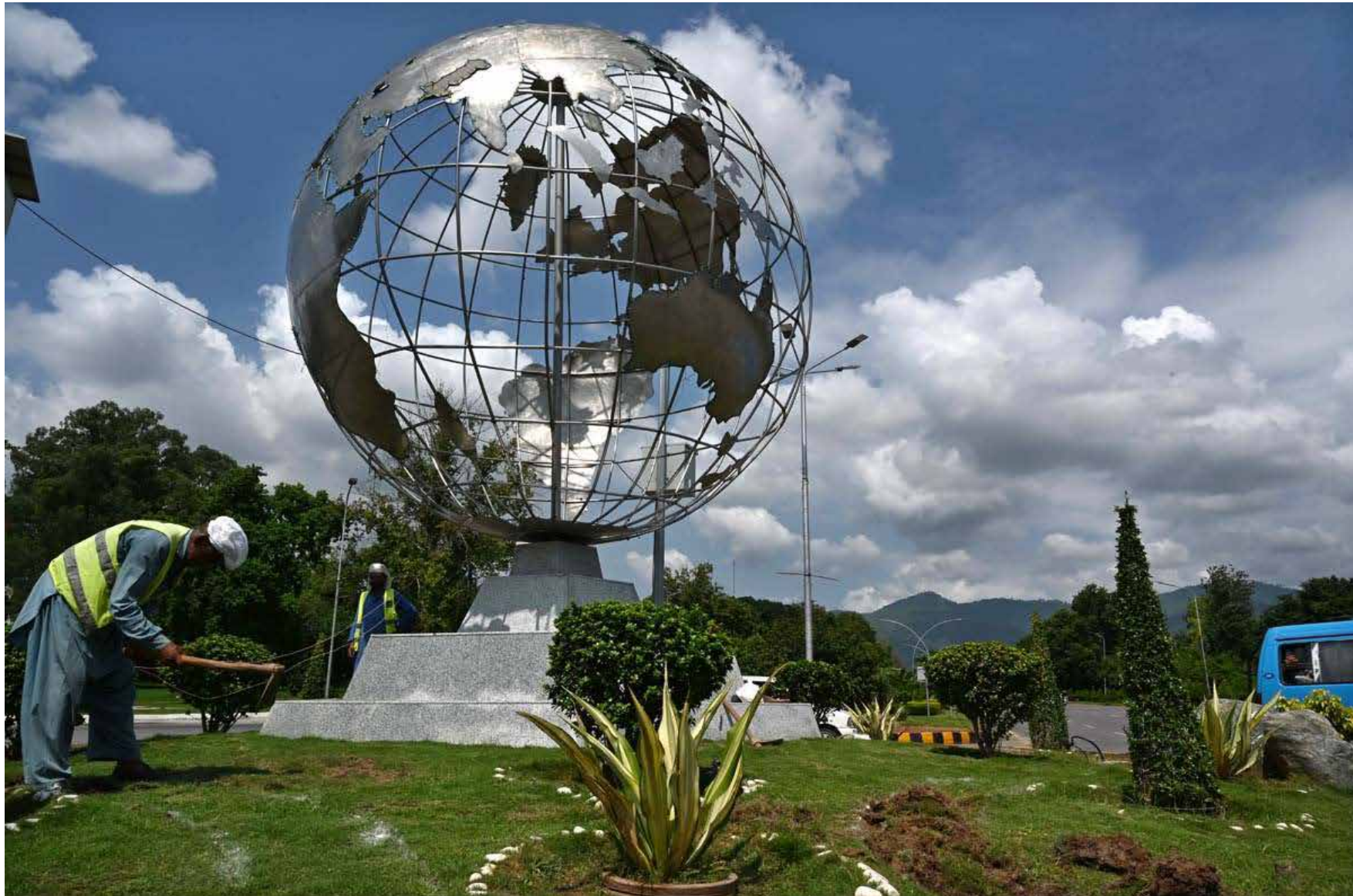
ISLAMABAD: An attractive view of clouds hovering over the sky of Federal Capital.

With the deadline fast approaching, aspiring eco-entrepreneurs should register quickly to take advantage of this golden opportunity.—APP