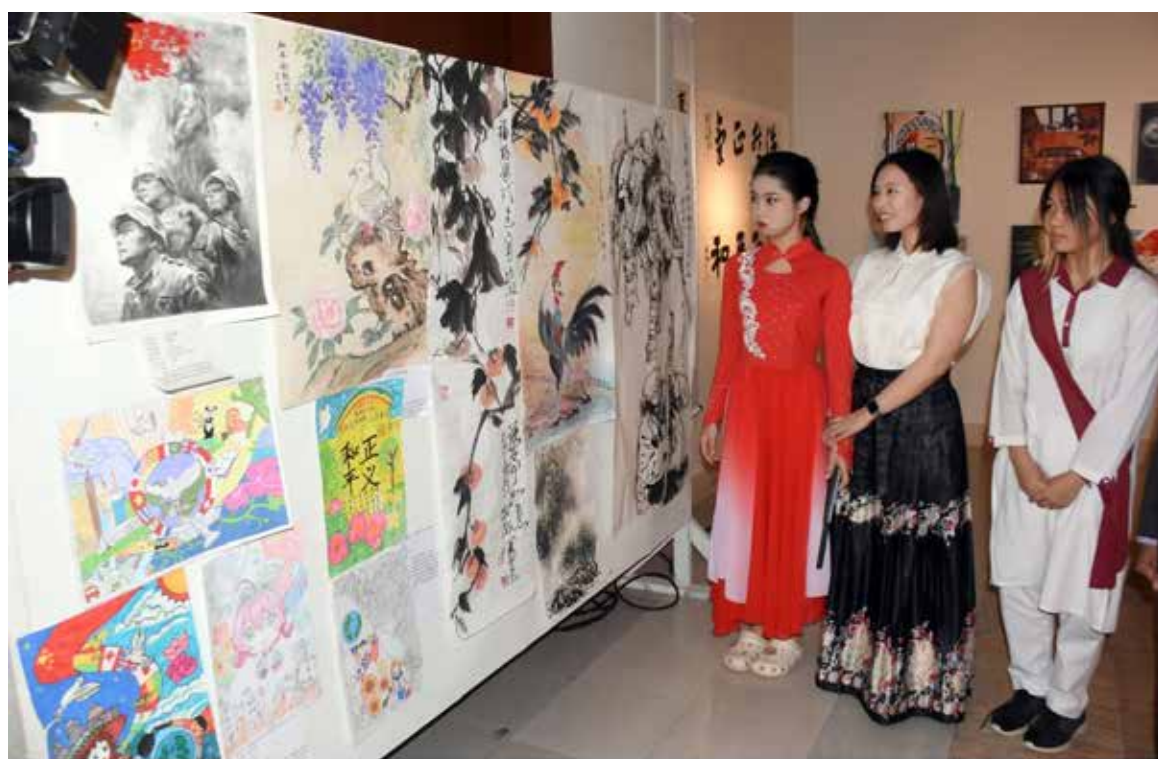
ISLAMABAD: Diplomats taking keen interest in paintings during "China-Pakistan Children's Painting Competition" at Pakistan National Council of Arts, in connection with 80th Anniversary of the Victory of the Chinese People's War of Resistance Against Japanese Aggression and the World Anti-Fascist War.