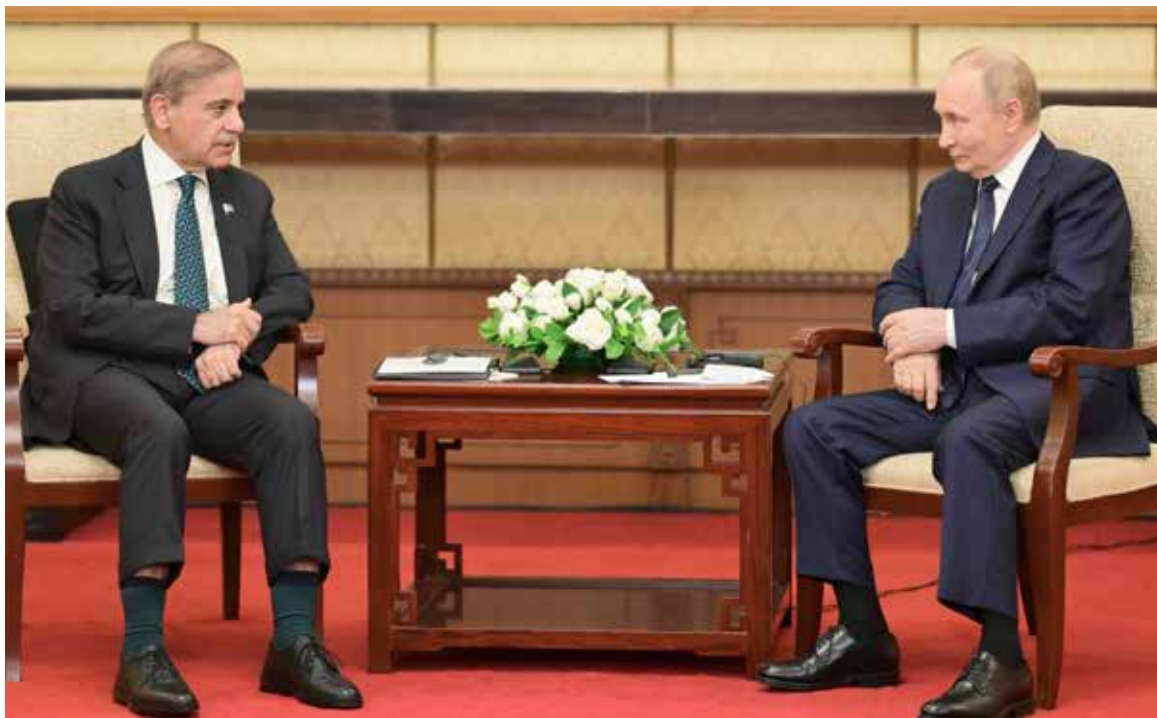
BEIJING: Prime Minister Shehbaz Sharif in a meeting with the Russian President Vladimir Putin. Both leaders met in Beijing after attending the SCO summit.