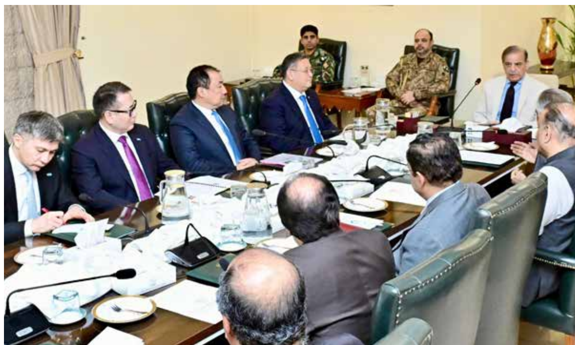
ISLAMABAD: Deputy Prime Minister and Foreign Minister of Kazakhstan, Mr. Murat Nurtleu calls on Prime Minister Muhammad Shehbaz Sharif (9 September, 2025). Prime Minister Shehbaz Sharif said Pakistan greatly valued its ties with Kazakhstan. – DNA

Fire destroys garment factory in Karachi