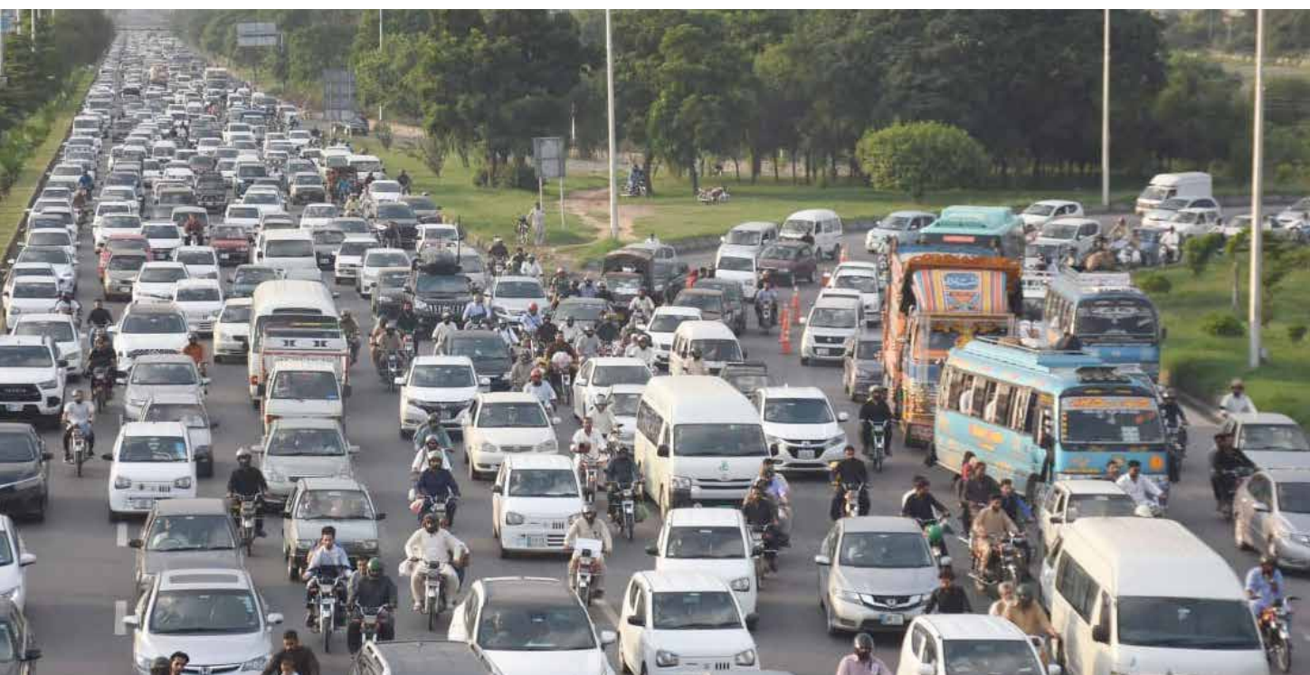
ISLAMABAD: A view of a massive traffic jam at the Faizabad interchange. The traffic jam has become a routine thus causing troubles to the commuters. —DNA