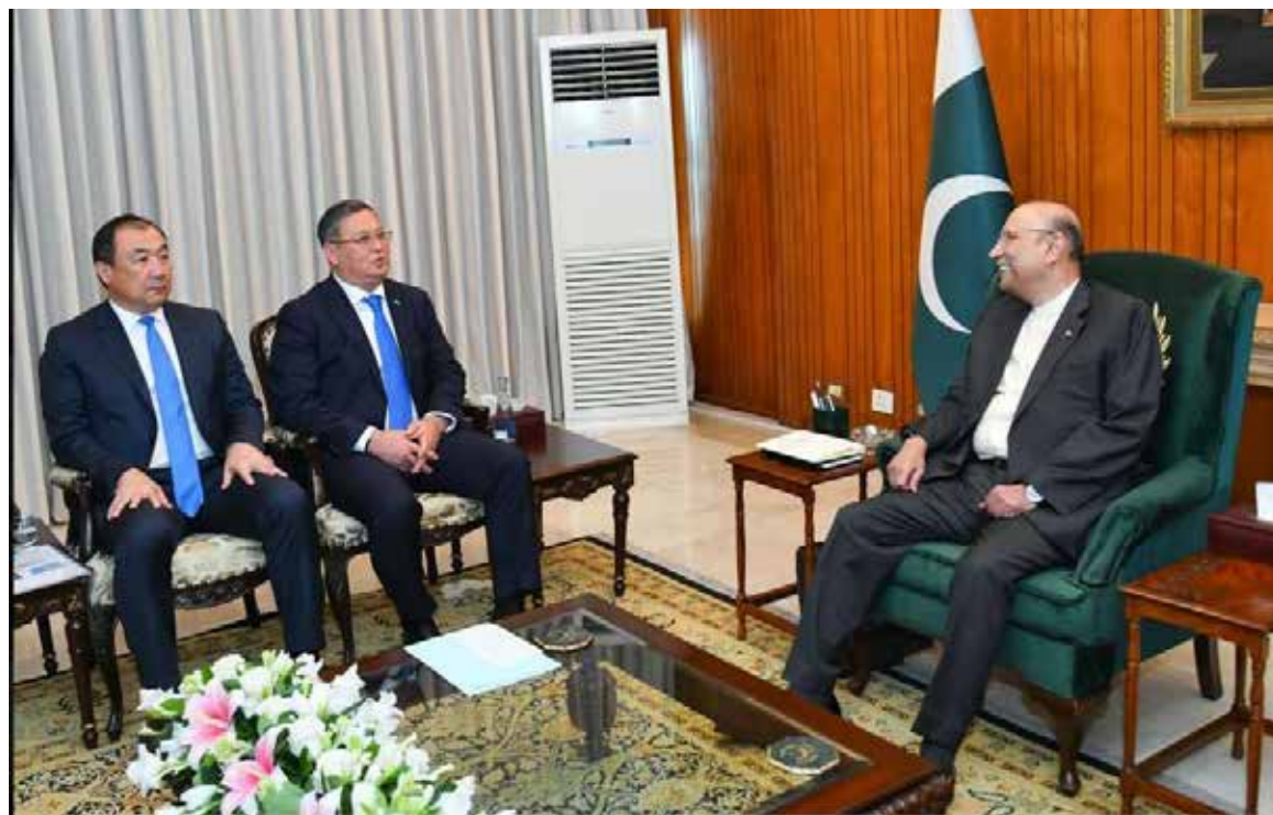
ISLAMABAD: President Asif Ali Zardari in a meeting with Deputy Prime Minister and Foreign Minister of Kazakhstan Murat Nurtleu, at Aiwan-e-Sadr.

Dr. Adel Abdulrahman Al-Moawda appreciated Speaker NA's positive sentiments regarding Bahrain and emphasized that Bahrain attaches great importance to its longstanding friendly and brotherly relations with Pakistan. He reaffirmed Bahrain's desire to further consolidate these ties. He also acknowledged the constructive role of the Pakistani community in Bahrain, noting their valuable contribution to the Kingdom's socio-economic development. He stressed the importance of further enhancing mutual cooperation between the two countries.