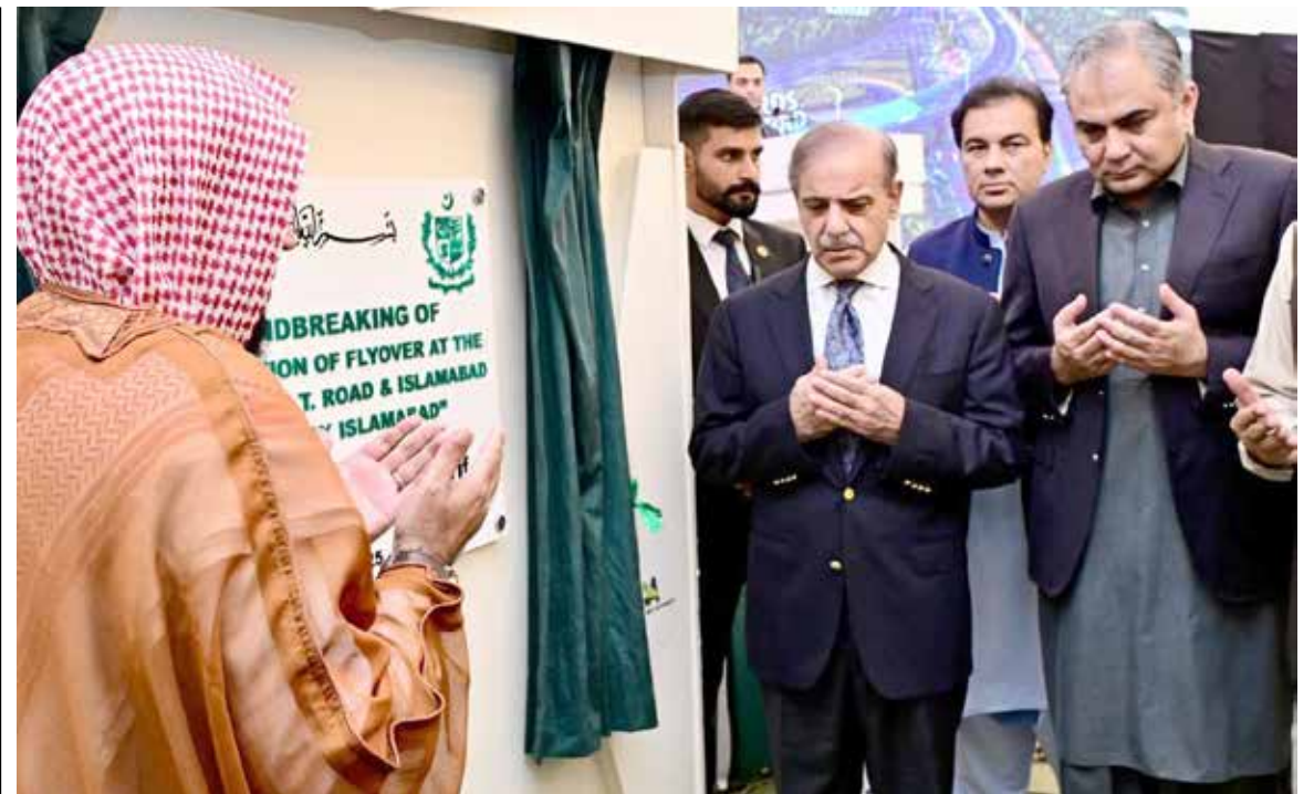
RAWALPINDI: Prime Minister Muhammad Shehbaz Sharif addresses the ground breaking ceremony of T-Chowk Flyover.