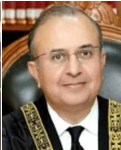
stice. Sources revealed that the Supreme Court Registrar office conveyed in its response to the school that the new judicial

year would begin on September 8, marked by a full-court session in which the annual programme is reviewed. The office had further informed the school that this session, along with key institutional events and interactions with the legal community, has become a tradition. It added that the participation of all judges in the opening ceremony of the new judicial year is essential for collective deliberation, setting priorities, and determining the institutional direction. In these circumstances, the Registrar Office conveyed that the Supreme Court was not in a position to facilitate Justice Mansoor's participation in the event. Sources said that Justice Mansoor, in a letter dated August 15, once again requested the chief justice to issue him the NOC, citing several reasons why it should be granted. Earlier, in February, Justice Mansoor's request for leave to attend arbitration events in Saudi Arabia was also denied, forcing him to cancel his trip.