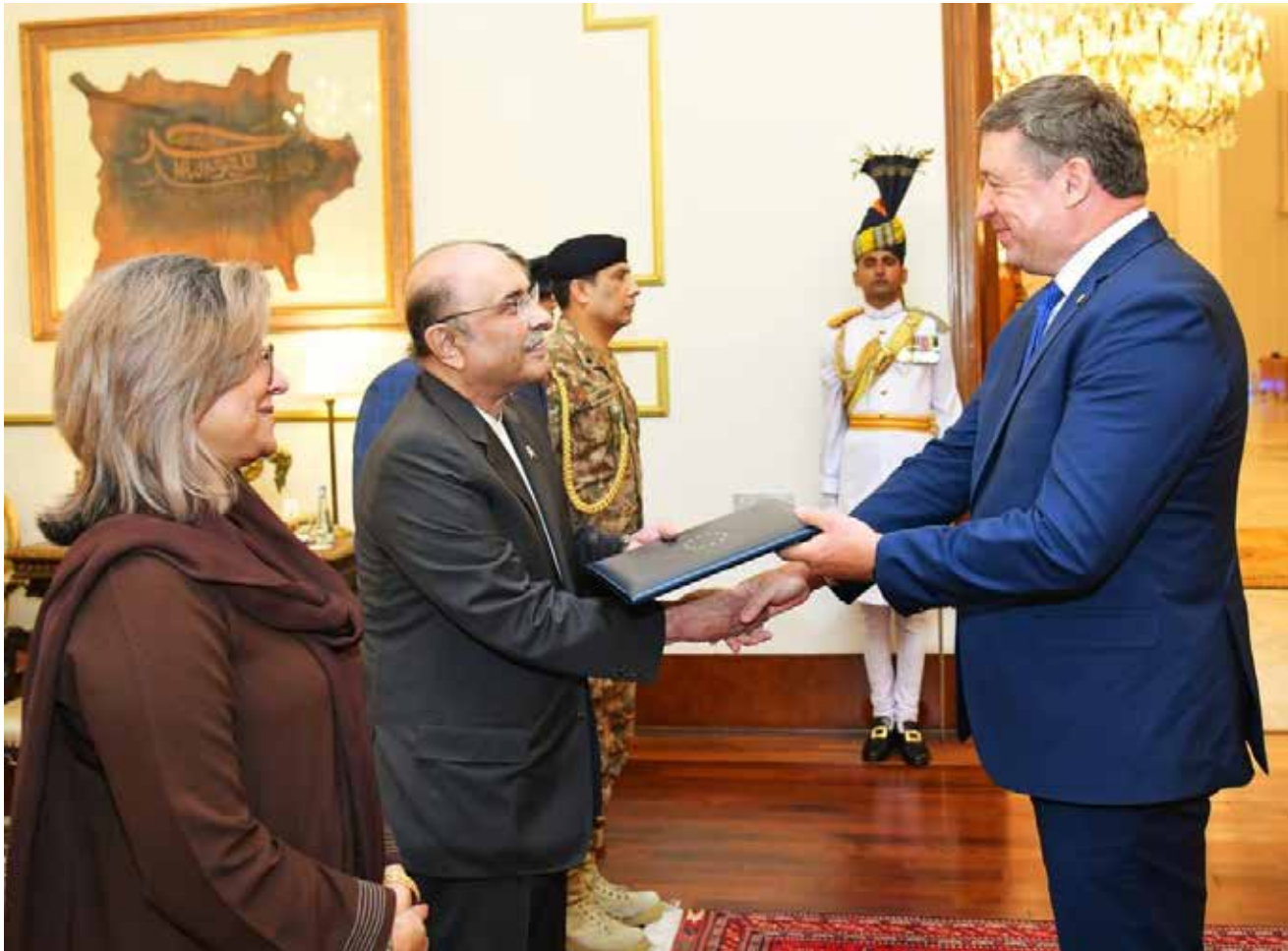
ment will inject fresh momentum into bilateral relations with Pakistan. Under his leadership, the EU aims to expand operation in key sectors including trade, governance, development, climate action, and regional stability.