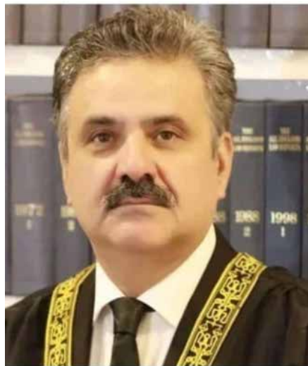
officially nominate Justice Mansoor. On August 6, Justice Mansoor himself submitted the same request to the chief jus-

ISLAMABAD: Chief Justice of Pakistan (CJP) Yahya Afridi has once again refused to grant Justice Mansoor Ali Shah a no-objection certificate (NOC) to attend an international event abroad. Last month, Yale Law School in the United States invited Justice Mansoor to participate in a conference – “Global Constitutionalism 2025” – scheduled for September 10 to 13, The News reported. It was learnt that the school has been inviting Justice Mansoor to the conference for the past five years. The gathering is attended by senior judges from around the world as well as renowned scholars from Yale, Harvard and Princeton universities. Sources said that Justice Mansoor was scheduled to present a paper on artificial intelligence and the judiciary at the event. Yale Law School had also made a formal written request to the CJP to