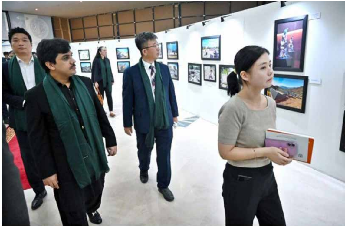
ISLAMABAD: Minister of State for National Heritage & Culture Division Huzifa Rehman visiting during opening ceremony of Digital Immersive Gallery at Islamabad Museum.

tion. Regulation alone is not enough – we need behavioral change to replace throwaway habits with sustainable practices," Alam emphasized. As part of the government's "Plastic-Free Pakistan" campaign, alternatives such as cotton bags, paper packaging, and biodegradable products are being promoted. Confiscated plastics are also being repurposed into benches and planters to encourage a zero-waste lifestyle. The campaign is backed by community engagement and awareness drives to help citizens adopt greener practices. Alam urged industries, local authorities, and the public to take joint responsibility, pointing to Punjab's partial success with plastic bans as a model to expand. "Together, let us turn the tide on plastic pollution to secure healthy rivers, vibrant habitats, and sustainable communities," she said. "This is an investment in our environment and economy that safeguards both current and future generations."