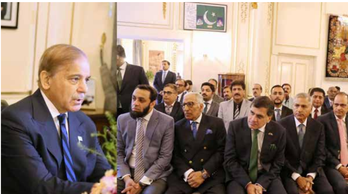
LONDON: Prime Minister Shehbaz Sharif addresses the overseas Pakistanis in London.

Bajaur blast Army's swift action saves children's lives