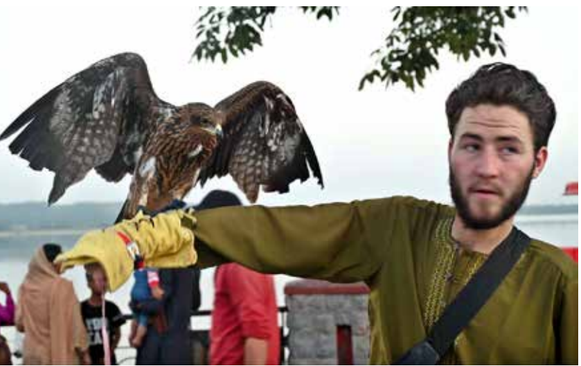
ISLAMABAD: A person shows a falcon to attract customers at Lake View Park, as people take pictures with the bird.

by vaccination teams and special counters at public places, schools, and health centers. The meeting also reviewed the record of polio cases reported from 2016 to 2025. The data was compared with the situation in other provinces to assess Islamabad's progress against the virus. Officials noted that while significant gains have been made, Pakistan remains one of the few countries where polio has not yet been eradicated. The Deputy Commissioner underlined the need to address gaps identified during previous campaigns. _APP