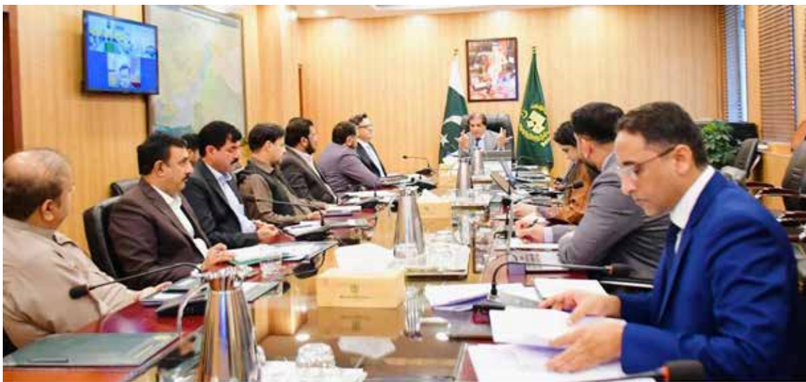
ISLAMABAD: Federal Minister for Railways, Muhammad Hanif Abbasi chaired a crucial meeting addressing train delays and punctuality issues. (Story on Page-3)

Repeated calls for such support, alongside predictable multi-year funding for host countries like Pakistan, have yet to be fully realized, amid donor fatigue and delayed disbursements. He said that in the context of UN-80 and "humanitarian reset," these initiatives must help the UN respond to humanitarian crises more effectively. He said that Pakistan reiterates its commitment to partnering with the international community to find durable solutions to humanitarian situations. Looking ahead, we urge three imperatives: first, urgent investment in the countries of refugee origin for stability and reintegration; second, timely and predictable international support to offset the burdens on host communities; and third, fast track resettlement in third countries, he concluded.