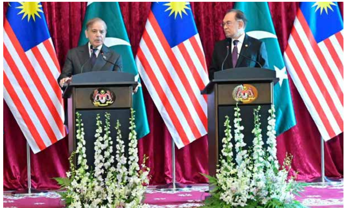
PUTRAJAYA: Prime Minister of Pakistan Muhammad Shehbaz Sharif and Prime Minister of Malaysia Dato Seri Anwar Ibrahim giving Joint Press statement.