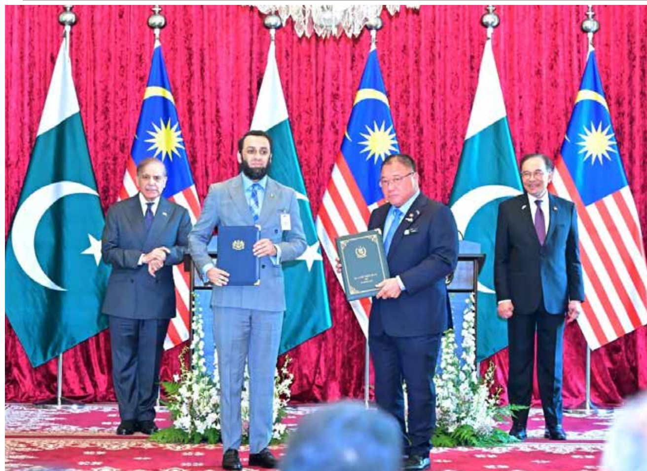
KUALUMPUR: Federal Information Minister Attaullah Tarar and Malaysian information minister exchange documents on the occasion of MoU signing ceremony.