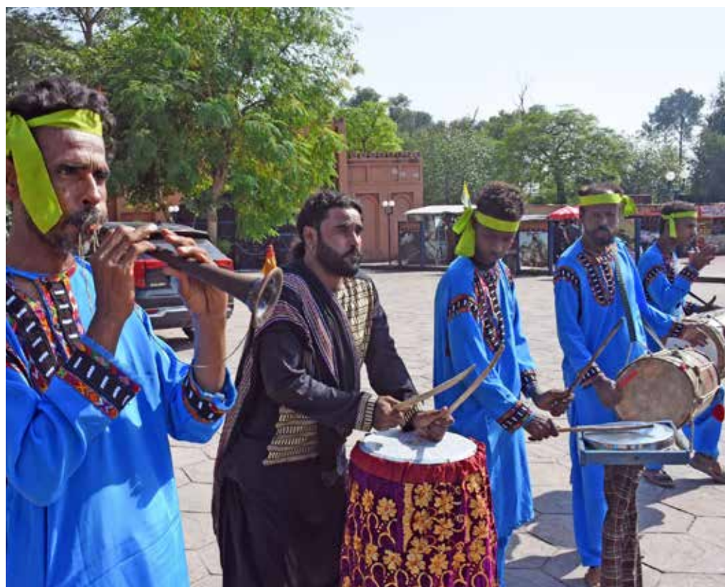
ISLAMABAD: Artists are performing during 03 Days Baluchistan Grand Tourism Festival at Lok Versa in Federal Capital.

He also looked forward to meeting the Saudi leadership again during the forthcoming Future Investment Initiative (FII) in Riyadh.