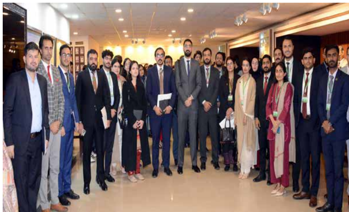
ISLAMABAD: A delegation of 53rd CTP probationary officers of the civil services academy visiting Senate museum at Parliament House.

constrained the sector's sustainability and export competitiveness. The seminar highlighted the policy's strong focus on revitalizing aquaculture as a key driver of alternative livelihoods and export growth, particularly in response to declining marine fish stocks. Successful pilot initiatives in freshwater and marine aquaculture were cited as evidence of the sector's commercial viability when supported by modern infrastructure, research, and regulatory clarity. Participants were also briefed on major institutional reforms proposed in the policy, including the declaration of fisheries and aquaculture as an industry, tax and duty exemptions to encourage investment, the establishment of an Apex Council for coordination, the introduction of integrated e-governance systems, and strengthened monitoring, control, and surveillance mechanisms to curb illegal fishing.—APP