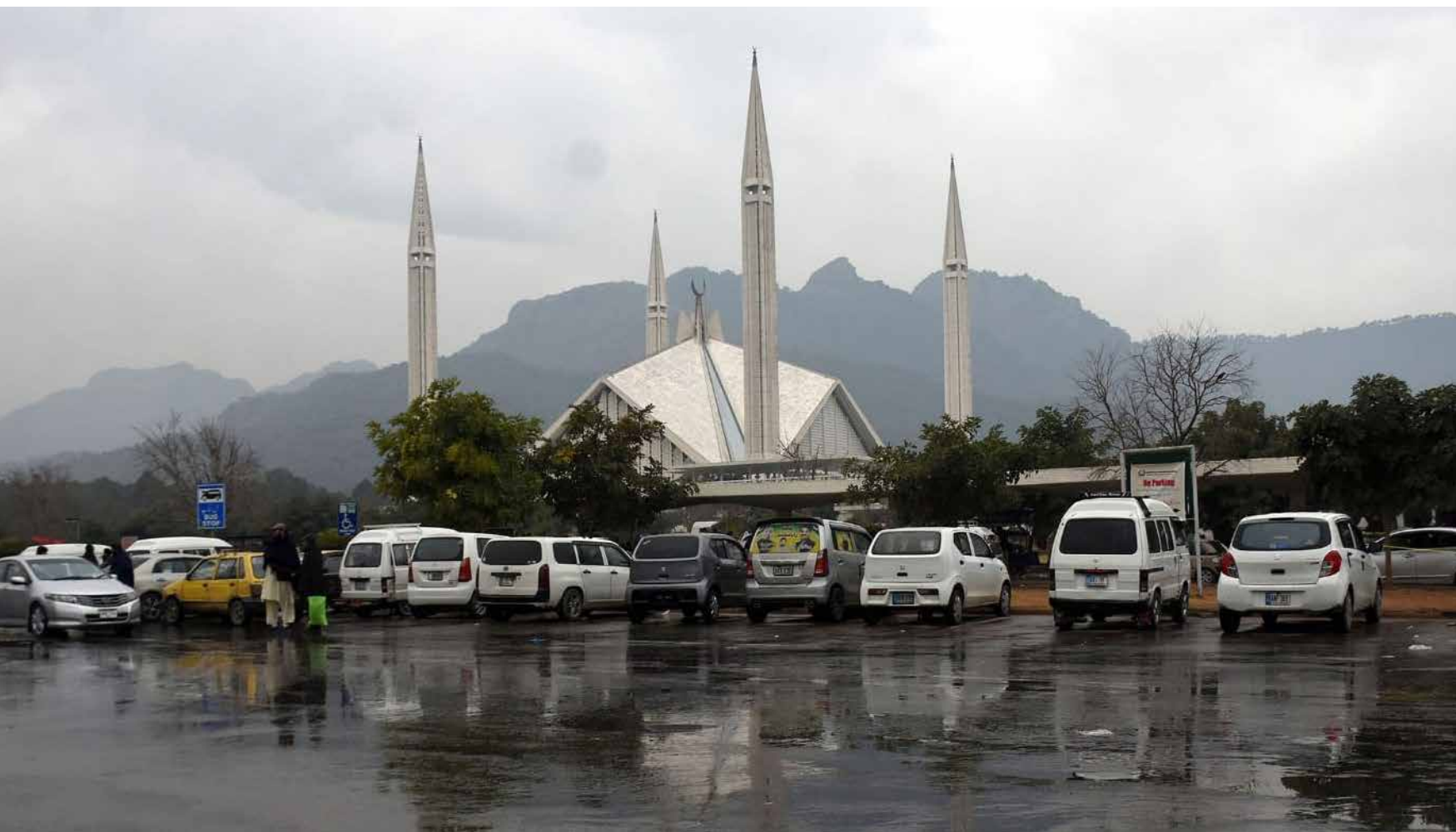
ISLAMABAD: A stunning view of the Faisal Mosque during rainy weather in Federal Capital. – Online

FROM PAGE 01 the Crown Prince for his enduring warmth, affection, and steadfast support towards Pakistan. The conversation also encompassed the regional situation and current developments. Emphasizing the importance of Muslim unity, Prime Minister Shehbaz Sharif stressed the need to maintain harmony within the Ummah amidst contemporary challenges. He expressed Pakistan's complete solidarity with the Kingdom and underscored the imperative of maintaining regional peace and stability through dialogue and diplomacy. Crown Prince Mohammed bin Salman thanked the Prime Minister for the call and reiterated Saudi Arabia's desire to expand cooperation with Pakistan across all areas of mutual interest.