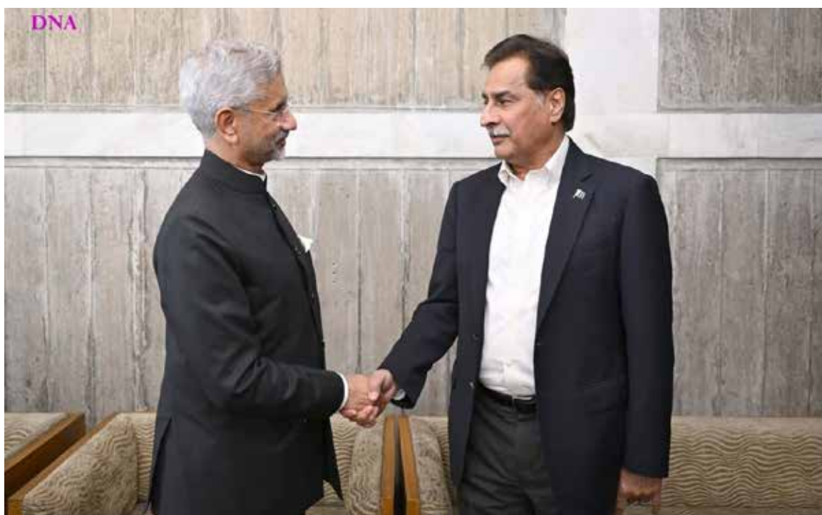
DKAHAK: National Assembly Speaker Ayaz Sadiq and Indian External Affairs Minister Subrahmanyam Jaishankar held a meeting in Dhaka.