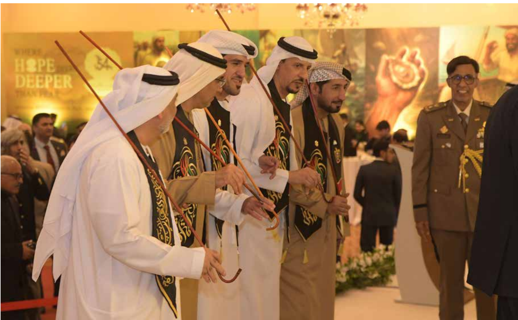
ISLAMABAD: UAE nationals presenting a culture show on the occasion of the Eid Al Etihad Day celebrated at the Islamabad Serena Hotel.