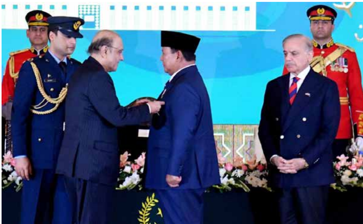
ISLAMABAD: President Asif Ali Zardari confers prestigious Nishan-e-Pakistan award upon the President of Indonesia, Prabowo Subianto during an investiture ceremony.

for economic stability and sustainable growth. Steering the country away from the brink of default and placing it firmly on the path of stability and progress has been an extraordinarily challenging journey which was overcome consequent to efforts by political parties which sacrificed their politics and the economic difficulties endured by the nation," he remarked. The prime minister viewed that Pakistan's economic reforms and digitization had become a successful case study and an example for the world. "Insha Allah, the dream of Pakistan's economic prosperity will soon come true," he commented. Prime Minister Shehbaz said that after achieving stability, the economy was moving toward growth which required even more hard work. "As Khadim-e-Pakistan, I will continue working until Pakistan achieves prosperity and gets deliverance from foreign debts. The time is not far when Pakistan will achieve complete riddance from debts and become economically self-sufficient," he added.