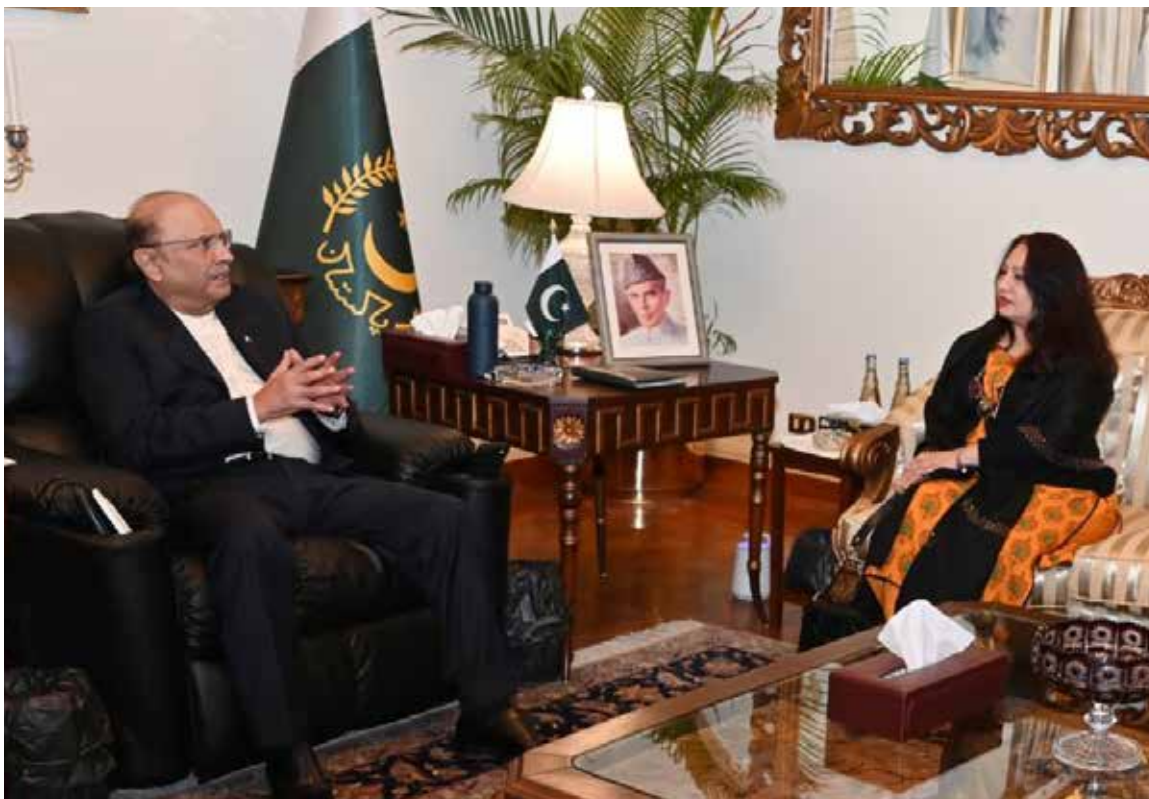
Islamabad: President Asif Ali Zardari with Ambassador-designate to Djibouti Ms Aqsa Nawaz at Aiwan-e-Sadr. =DNA

collaboration, including more training and provision of modern rescue gear. The foundation currently operates in over 20 countries, underscoring the international scope of the partnership. As storms, floods, and flash-flood risks persist in many parts of Pakistan, the transfer of these rescue kits and the strengthening of local emergency response capacities come at a crucial time.