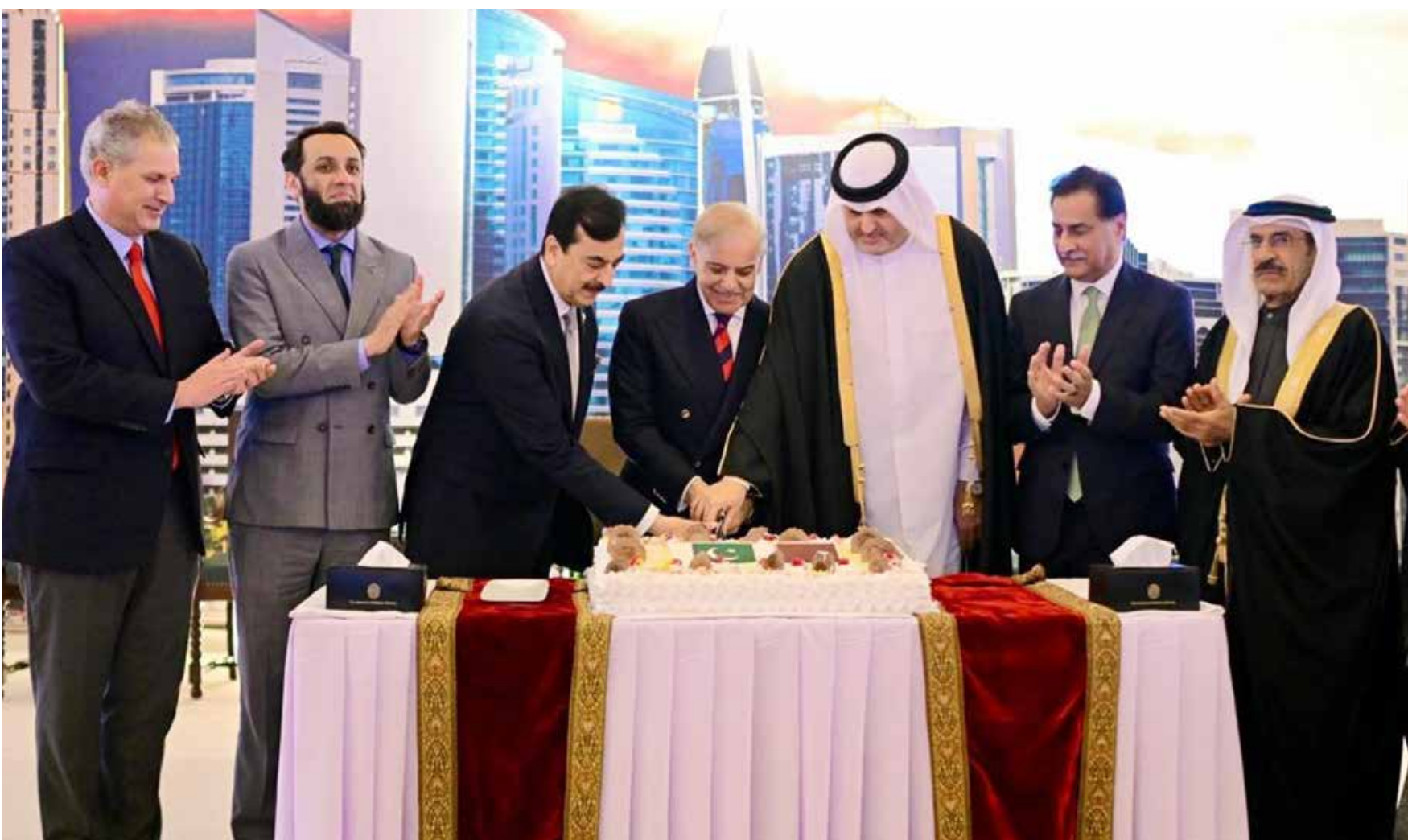
ISLAMABAD: Prime Minister Muhammad Shehbaz Sharif with other guests cutting cake to mark Qatar's National Day ceremony.