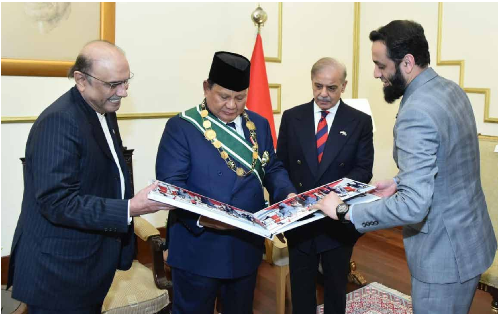
ISLAMABAD: Federal Minister for Information and Broadcasting Attaullah Tarar presenting a photo album to Indonesian President Prabowo Subianto, in the presence of President Asif Ali Zardari and Prime Minister Muhammad Shehbaz Sharif at Aiwan-e-Sadr.