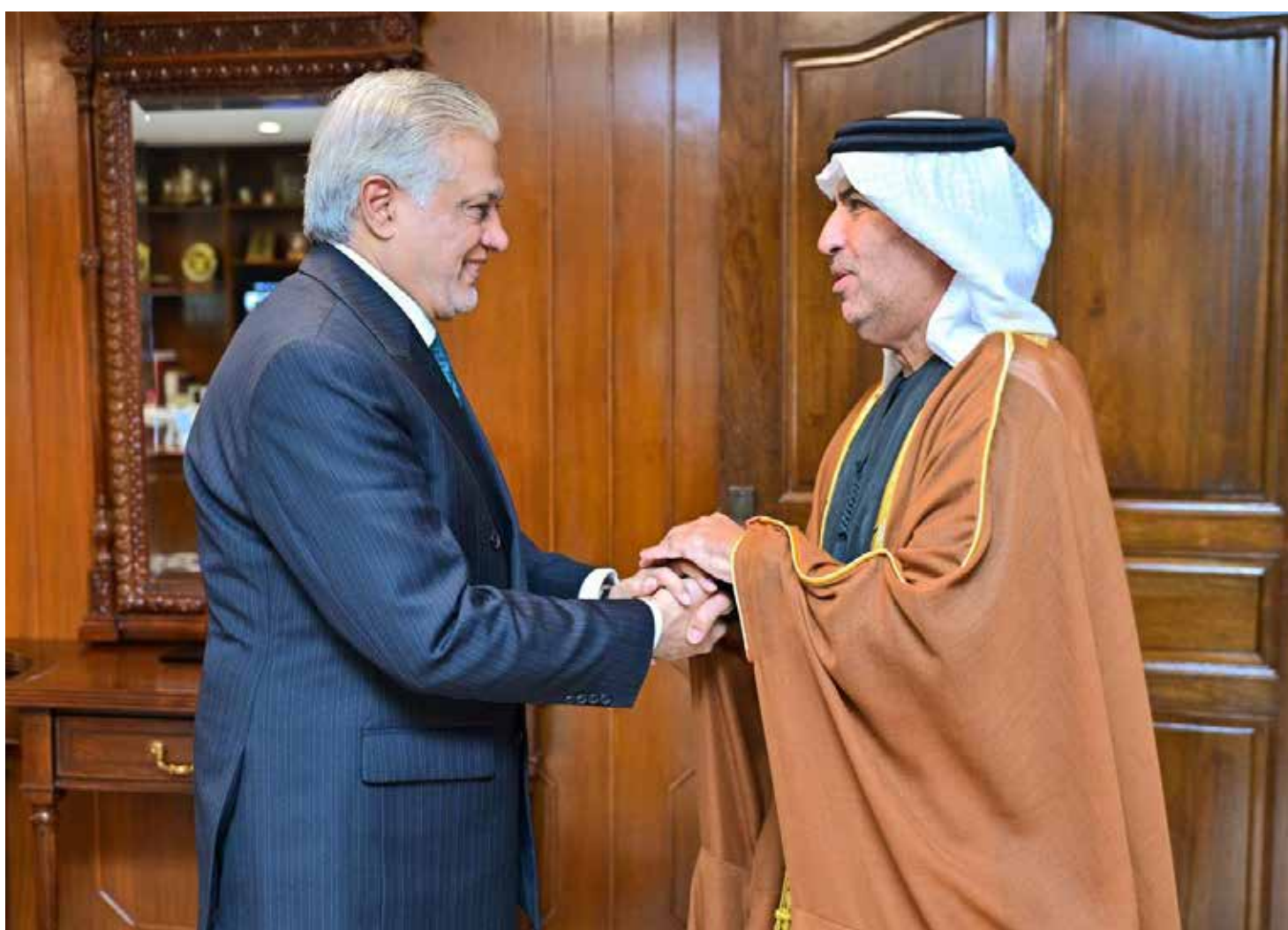
ISLAMABAD: Ambassador of the UAE to Pakistan, Salem Mohammed Salem Al Bawab Al Zaabi, called on the Deputy Prime Minister/Foreign Minister of Pakistan, Senator Mohammad Ishaq Dar.

ISLAMABAD: Ambassador of the UAE to Pakistan, Salem Mohammed Salem Al Bawab Al Zaabi, paid a courtesy call on the Deputy Prime Minister/Foreign Minister of Pakistan, Senator Mohammad Ishaq Dar. The DPM/FM extended warm felicitations on the 54th Eid Al Etihad of the UAE, reaffirming the historic fraternal ties and strategic partnership between Pakistan and the UAE, which continue to grow across all domains. He conveyed best wishes to the Ambassador for a successful tenure in Islamabad, as both nations work to further deepen their enduring bilateral relationship for mutual progress and prosperity.—DNA