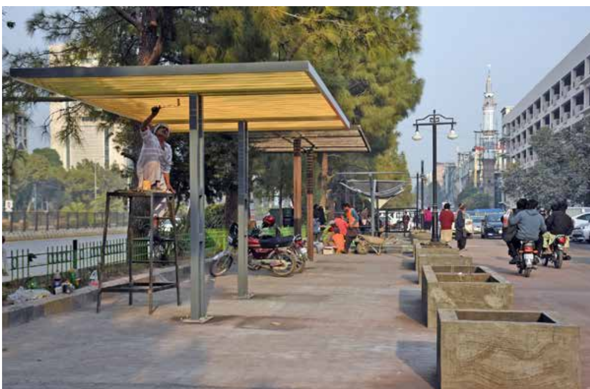
ISLAMABAD: Labourers are busy in construction work of newly food street at Blue area, in the Federal Capital.