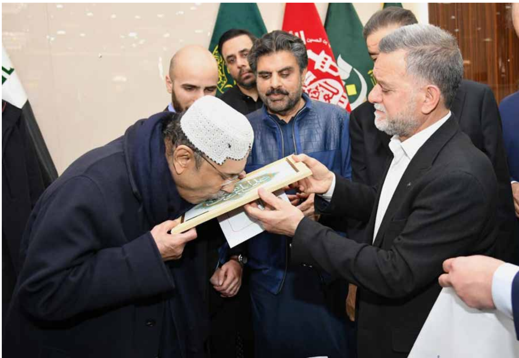
NAJAF, Iraq: President Asif Ali Zardari paid respects at the holy shrine of Hazrat Ali (R.A.), offered nawafil prayers and met the administrators of the shrine.