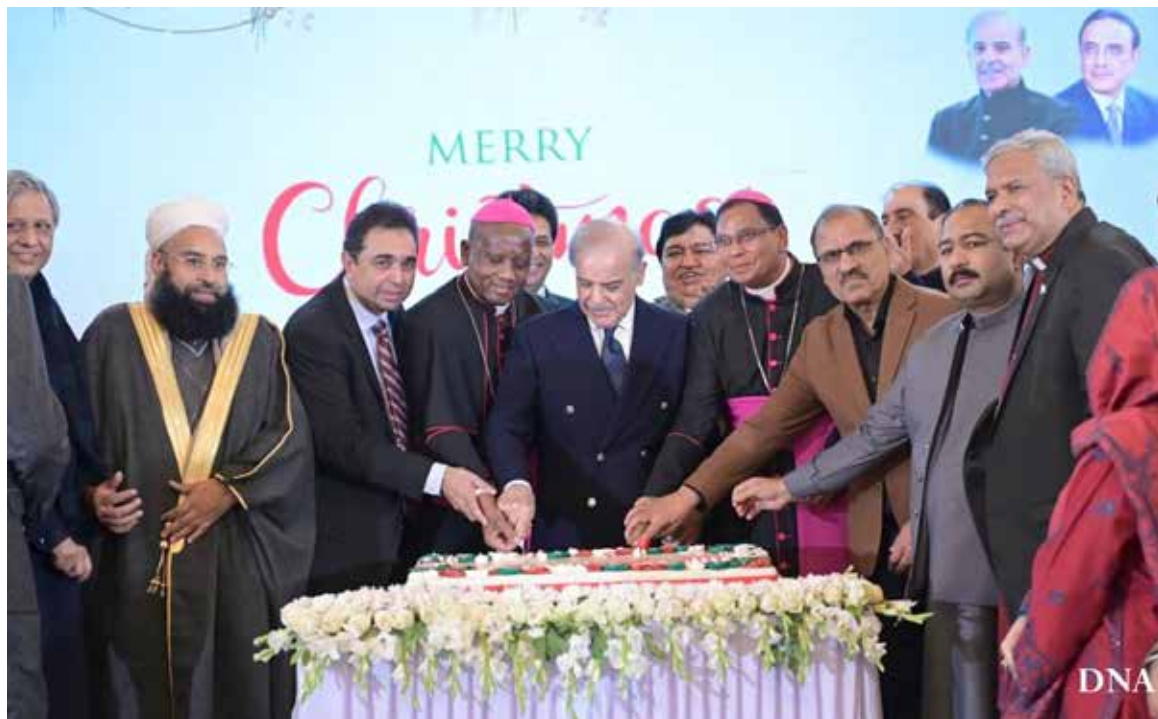
ISLAMABAD: Prime Minister Muhammad Shehbaz Sharif cuts a cake at the Christmas ceremony at PM House, in Islamabad on 25 December 2025.

U.S.-India partnership is facing structural challenges. Pakistan now finds itself in a unique window of opportunity to capitalize on this diplomatic "bonhomie." To solidify this position, the Pakistani government must urgently move beyond security cooperation and aggressively encourage the U.S. government and private firms to invest in the country. So far, U.S. direct investment in Pakistan has remained nominal, largely overshadowed by bilateral aid and military cooperation. However, the current alignment under the Trump administration provides a rare moment of political stability that can be used to attract American capital into critical sectors like mining, IT, and energy. Field Marshal Munir's recent presentation of rare earth minerals to the White House exemplifies the potential for a resource-driven partnership. By securing increased U.S. investments, Pakistan can significantly improve global investor confidence, signaling that the country is not just a security partner but a viable economic frontier. For Pakistan, the path forward is clear: leverage this newfound strategic proximity to transform its economy through deep-rooted American commercial ties.