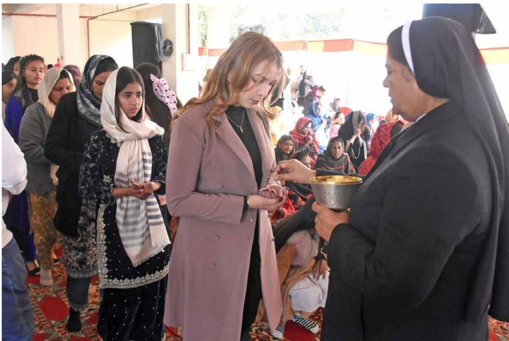
ISLAMABAD: Member of Christians Community are receiving Holy Simeon after attend Christmas Mass rituals at Lady Fatima Church of Sector F-8 in Federal Capital.

ISLAMABAD: Federal Minister for Science and Technology, Khalid Hussain Magsi Thursday urged the nation to renew its collective pledge to uphold Quaid-e-Azam's ideal, strengthen national unity, promote tolerance and work for a prosperous Pakistan. In a message, the federal minister paid rich tribute to Quaid-e-Azam Muhammad Ali Jinnah on his birth anniversary, honoring the founding father of Pakistan for his visionary leadership, wisdom, and unwavering determination that transformed the dream of an independent homeland into reality. He said that Quaid-e-Azam's guiding principles of Unity, Faith and Discipline continued to serve as a moral compass for the nation in confronting contemporary challenges. Khalid Magsi emphasized that Jinnah's steadfast commitment to justice, constitutionalism, tolerance and the protection of equal rights laid the firm foundations of a democratic and inclusive Pakistan. He noted that Quaid-e-Azam's message of respect for diversity, rule of law and interfaith harmony remained as relevant today as it was at the time of independence. The minister urged the nation to renew its collective pledge to uphold Quaid-e-Azam's ideals, strengthen national unity, promote tolerance, and work with dedication and integrity for a peaceful, progressive, and prosperous Pakistan for future generations.—APP