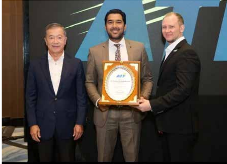
as secured 21 international wild cards for Pakistani players, and successfully hosted the first-ever ATP Challenger tournament in Islamabad, featuring top foreign profes-

ISLAMABAD: The Pakistan Tennis Federation (PTF) marked 2025 as a historic year, delivering notable international success, strengthening domestic structures, and significantly expanding grassroots development across the country. Pakistan clinched major international team-event medals during the year, highlighted by gold at the Davis Cup Juniors U16 in Malaysia, gold at the ATF South Asian U12 Championships in Sri Lanka. Pakistan also made a remarkable debut at the ITF Masters 45+ World Championships in Turkey, winning two gold and one bronze medal, while the Wheelchair Tennis Team earned a bronze medal at the ITF World Team Cup Qualifiers in Colombo. In recognition of its rapid progress, the Asian Tennis Federation (ATF) honored PTF as the fastest-progressing tennis federation in Asia, with the award presented to PTF President Aisam-ul-Haq Qureshi at the ATF Annual General Meeting in Almaty. Player development remained a top priority