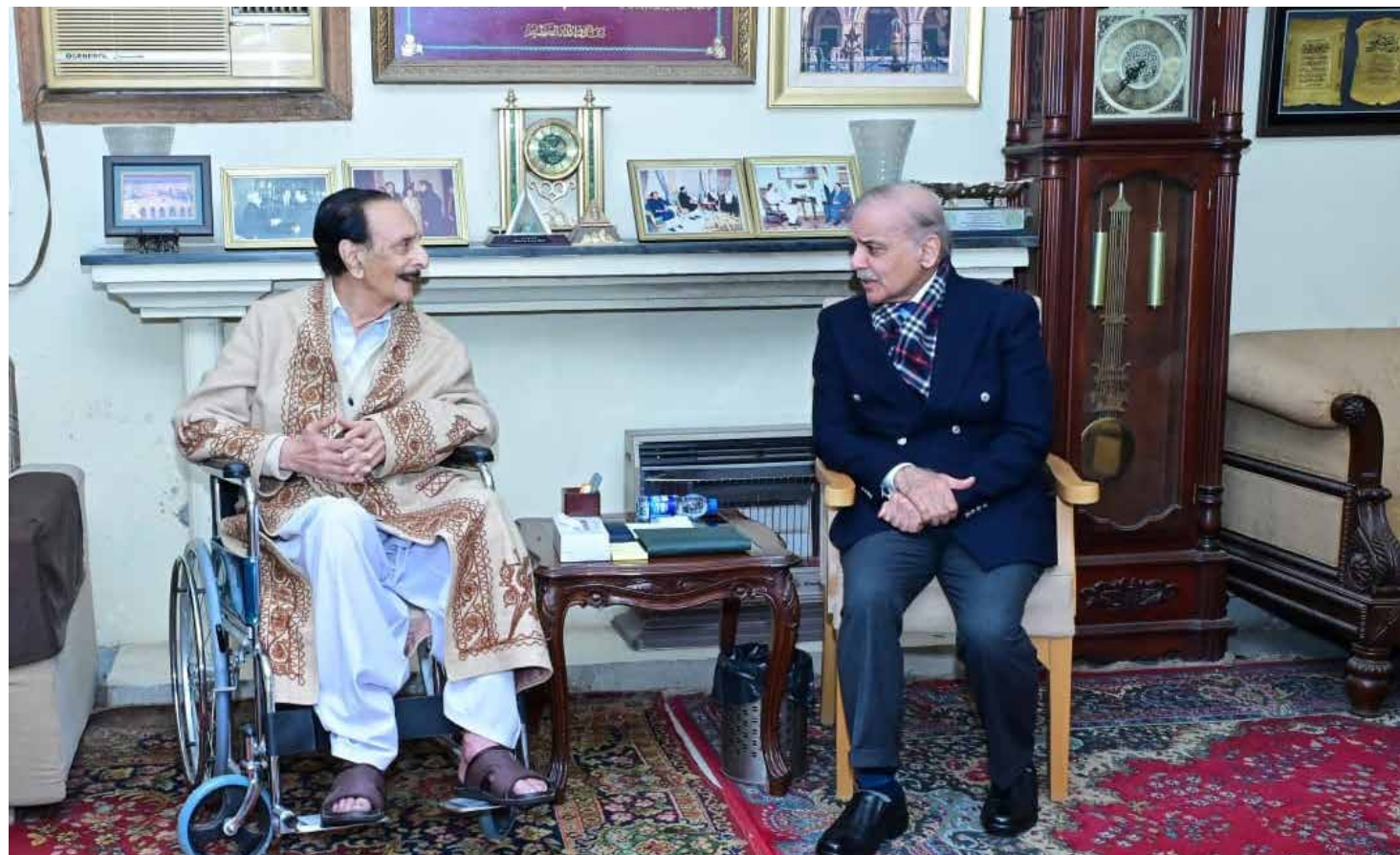
ISLAMABAD : Prime Minister Muhammad Shehbaz Sharif meets with the leader of PML N and senior politician Raja Zafar ul Haq at his residence.