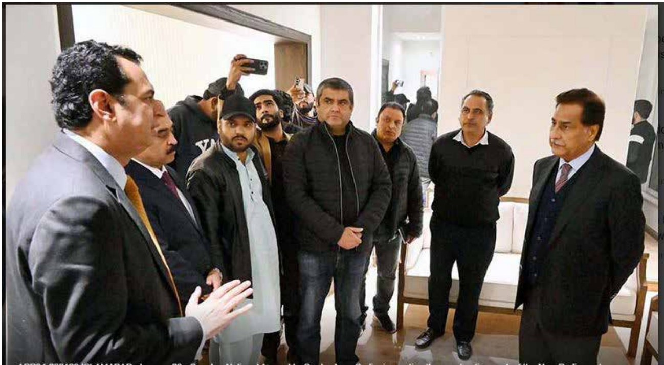
ISLAMABAD: Speaker National Assembly, Sardar Ayaz Sadiq, inspecting the construction work of the New Parliament Lodges Project.

instructed the CDA to remain under continuous monitoring to ensure quality, transparency and efficiency. Talal Chaudhry assured the Speaker that all available resources would be utilized to ensure the swift and